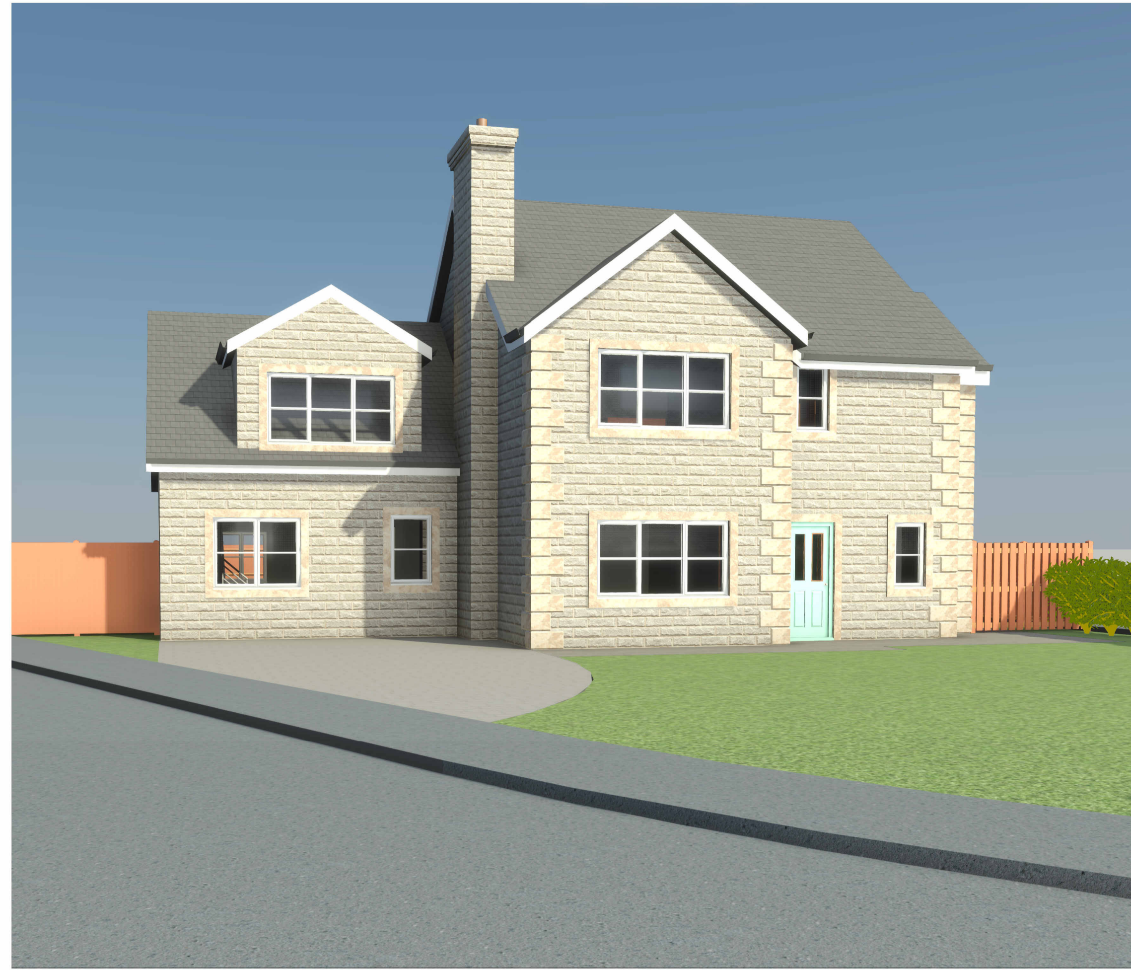
1 3D View 6