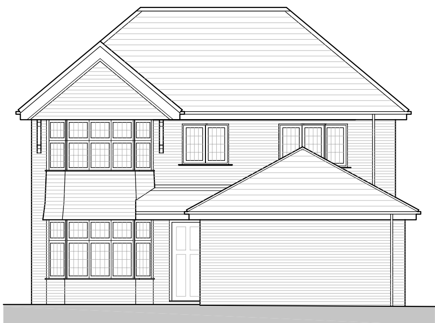
FRONT ELEVATION Existing