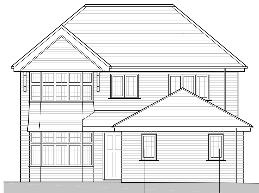
FRONT ELEVATION Proposed

White upvc framed windows and brick cill and head detail to match existing