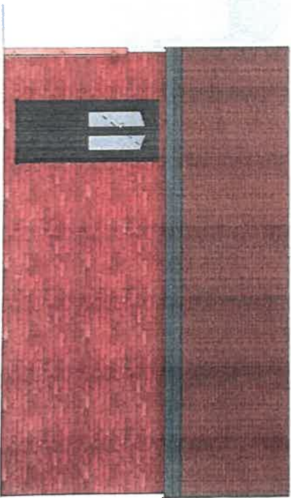
4 PROPOSED SOUTH 1 1:25