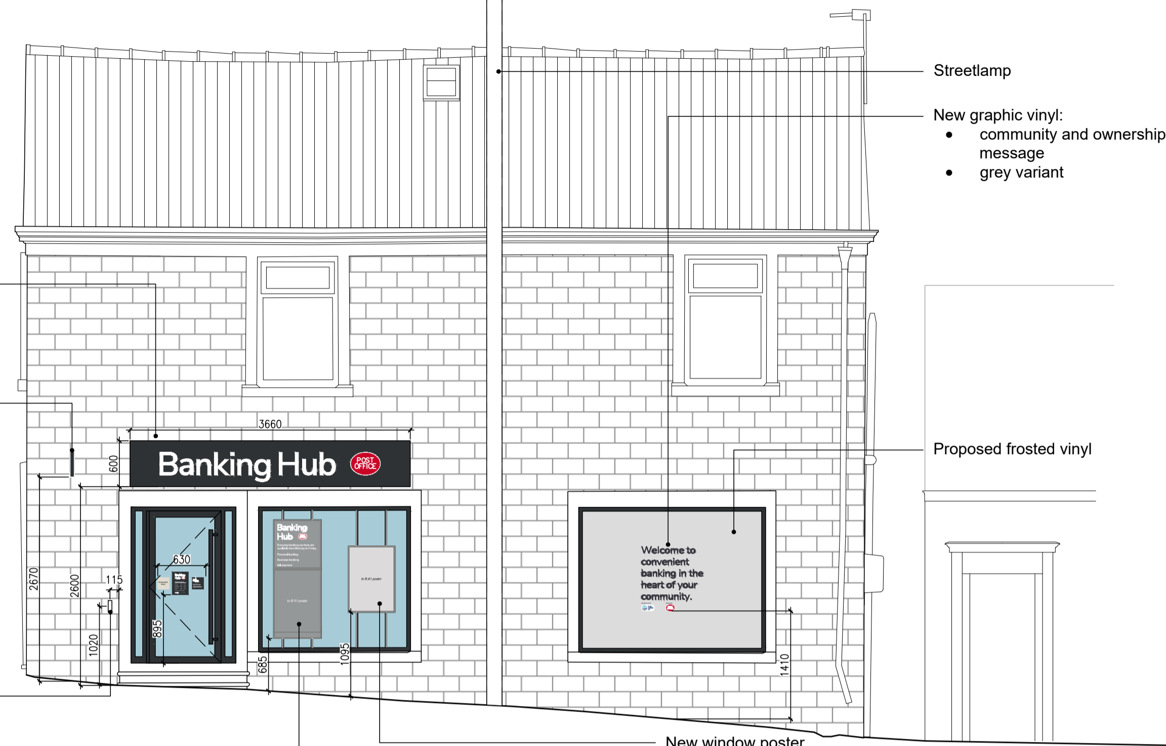
02 Front Elevation scale 1:50 @ A1

New directory of services: • non illuminated • A1 silver anodised clip • suspended