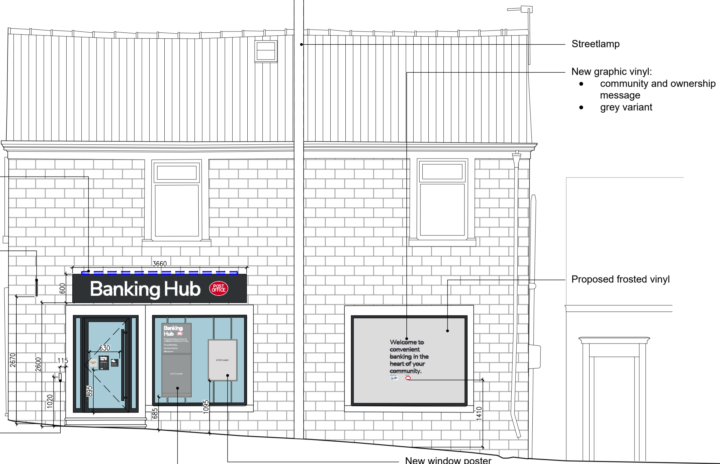
02 Front Elevation scale 1:50 @ A1

New directory of services: • illumination @ 600cd/m 2 • A1 silver anodised clip • suspended