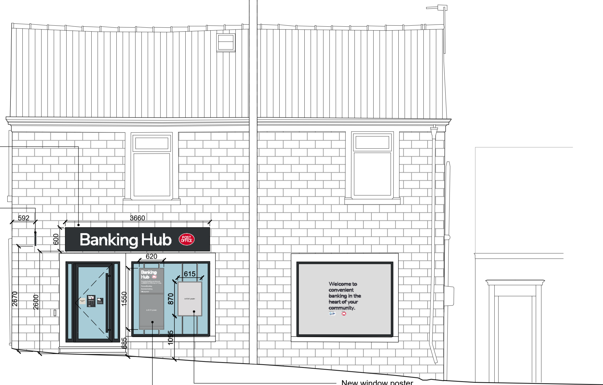
02 Front Elevation scale 1:50 @ A1

New directory of services: • non illuminated • A1 silver anodised clip • suspended