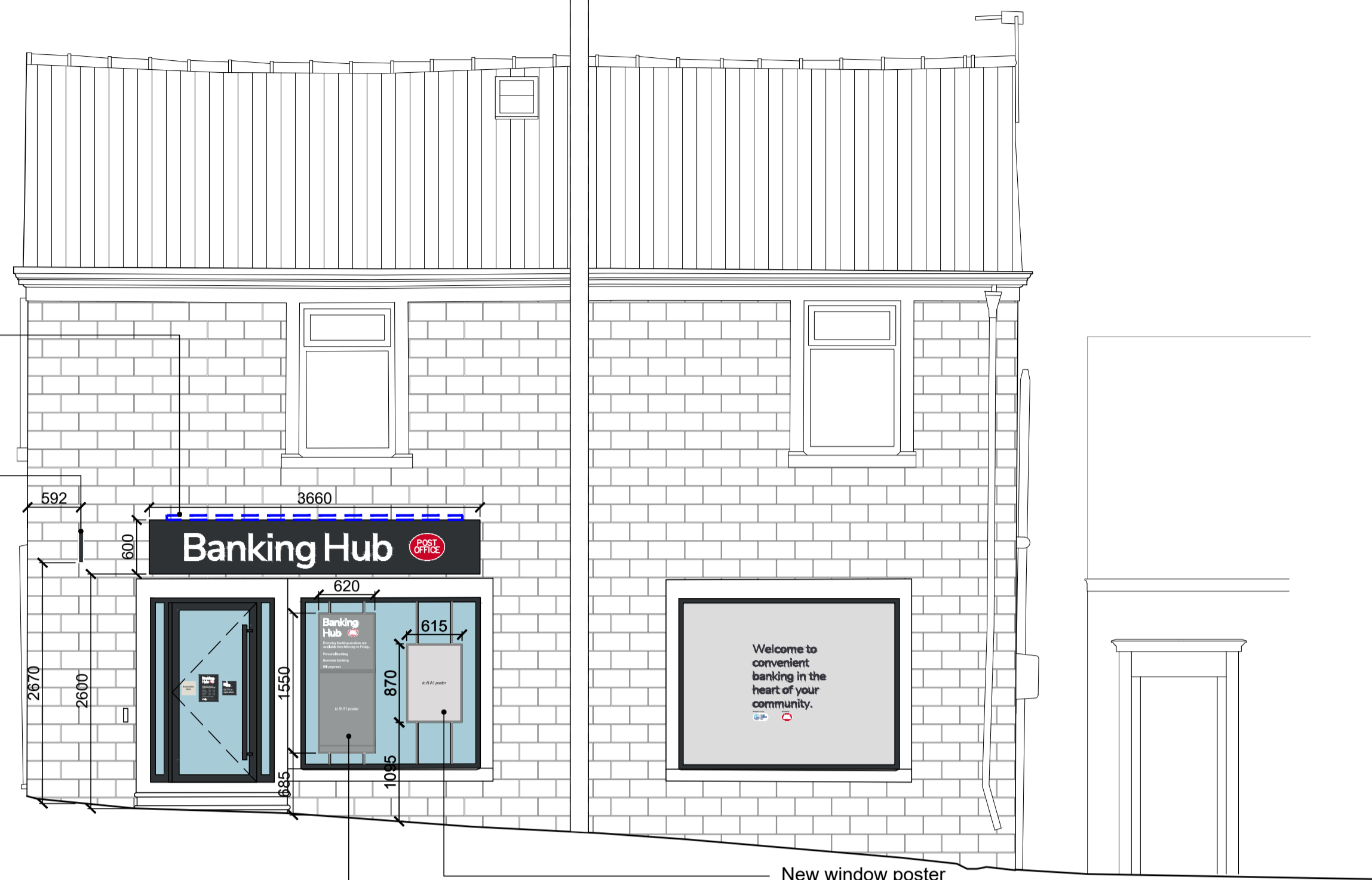
02 Front Elevation scale 1:50 @ A1