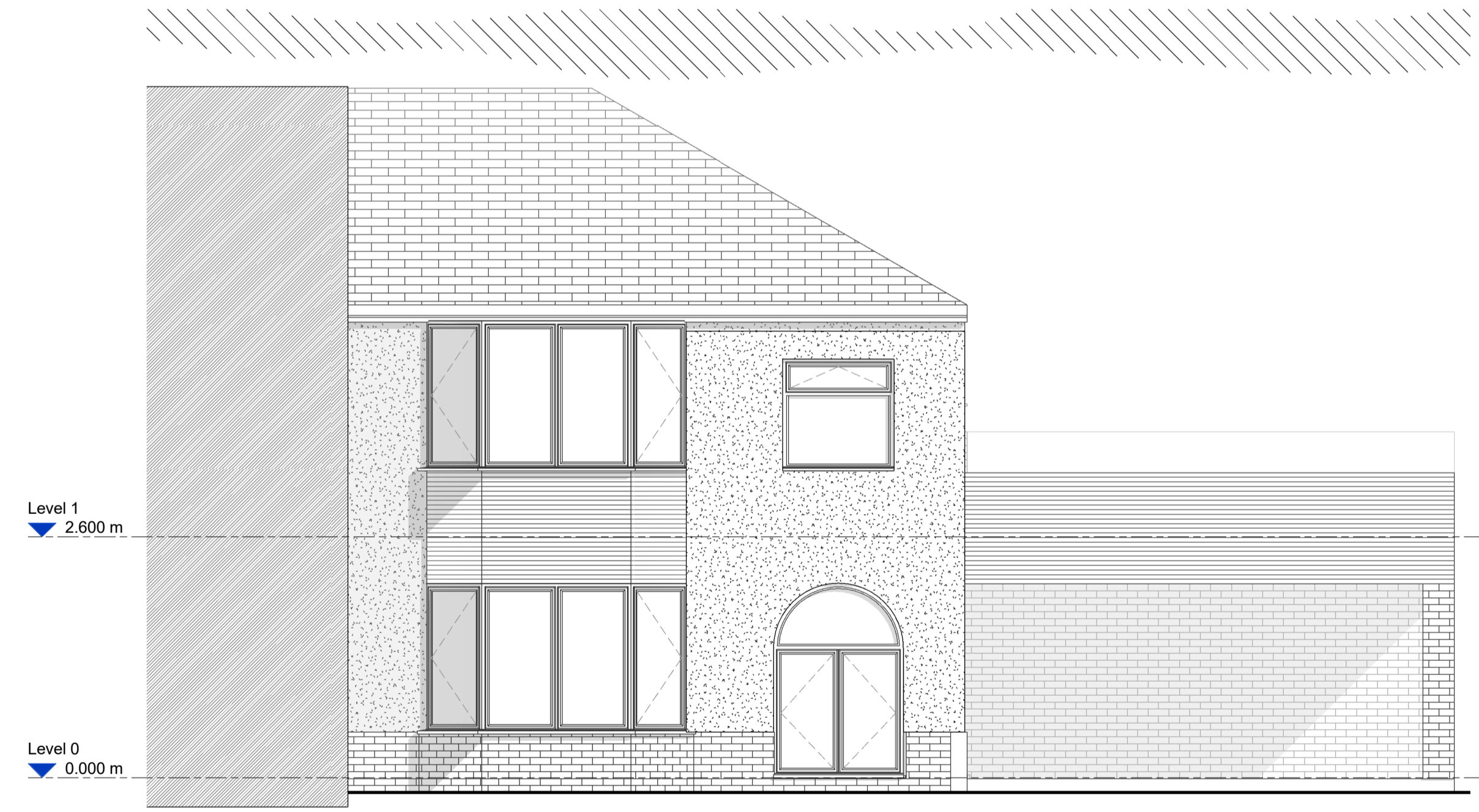
EXISTING SOUTH ELEVATION 1 : 50