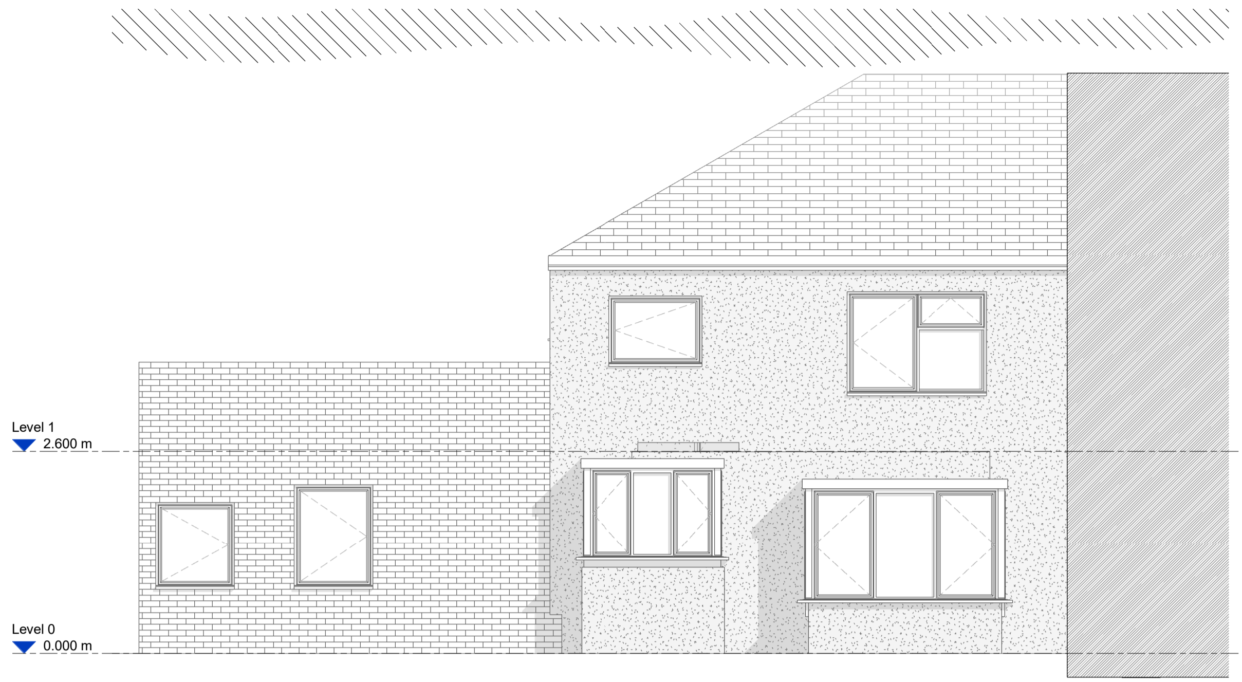
EXISTING NORTH ELEVATION 1 : 50