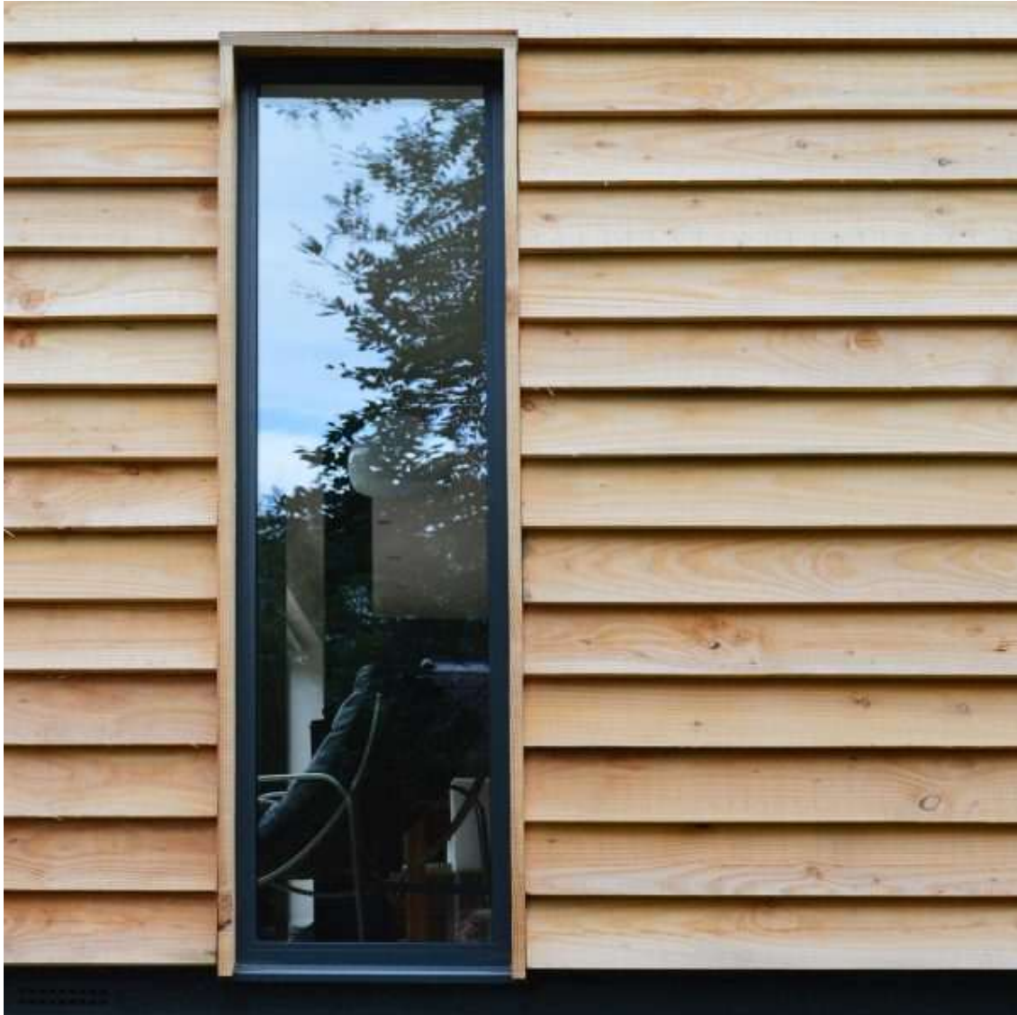
Detail of photovoltaic panels to sit within the western elevation of the blue slate roof