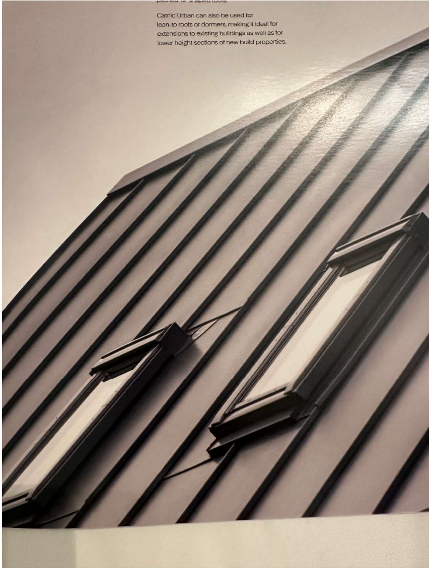
Subsidiary stone building roof - Blue slate