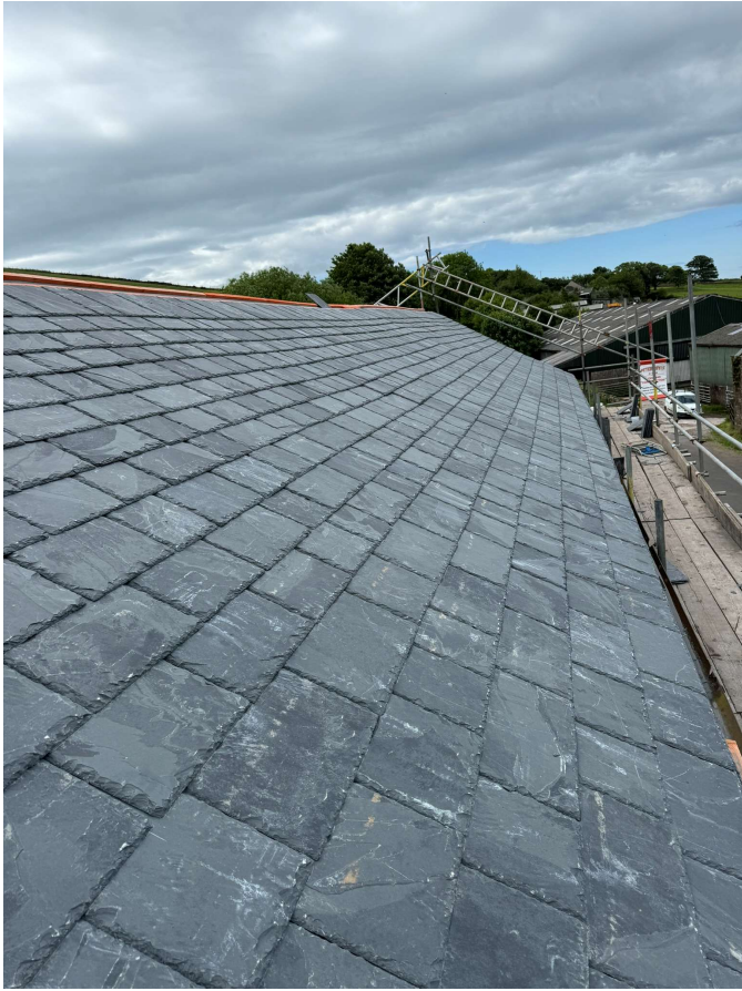
Windows – slimline aluminium with sliding panel on southerly elevation (photo indicative of windows only not cladding)