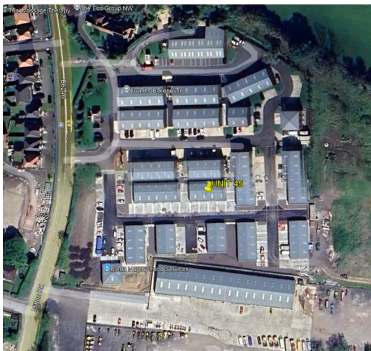
Figure 1: The Site and Wider Context of Mitton Road Business Park