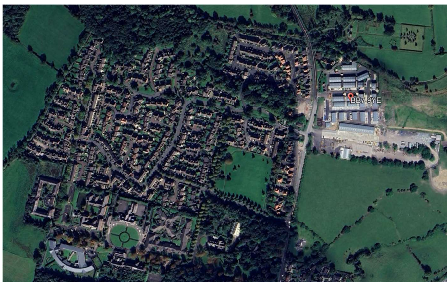
Figure 2: Aerial View of The Calderstones Development Directly Adjacent from The Business Park