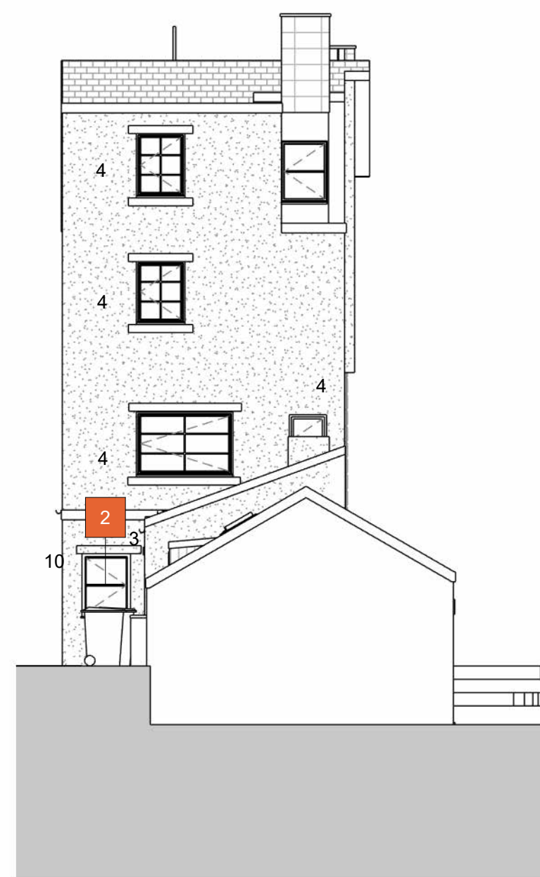
3 North Elevation as Proposed 1:100