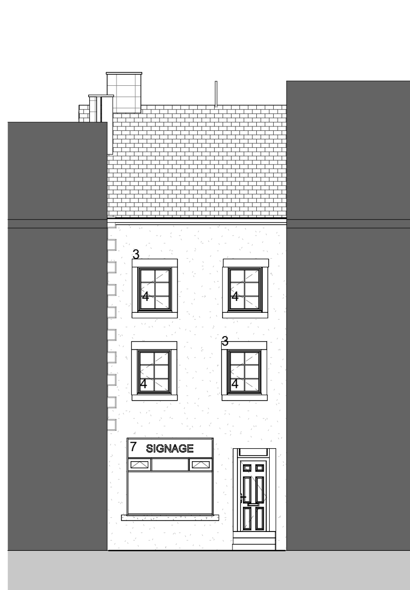
4 South Elevation as Proposed 1:100