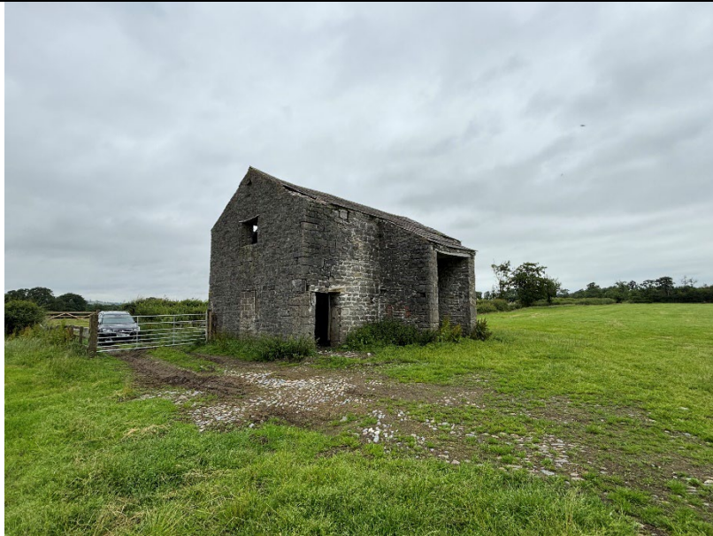
The front of the barn