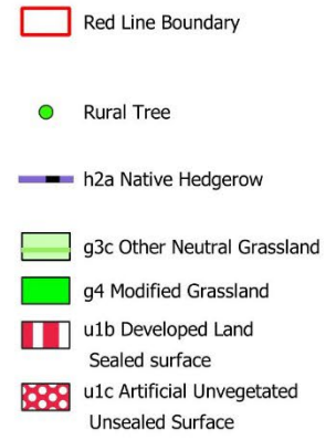
Figure 4 Post-development UK Habitats Survey Map