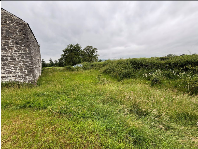
Verge of other neutral grassland between the barn and hedgerow