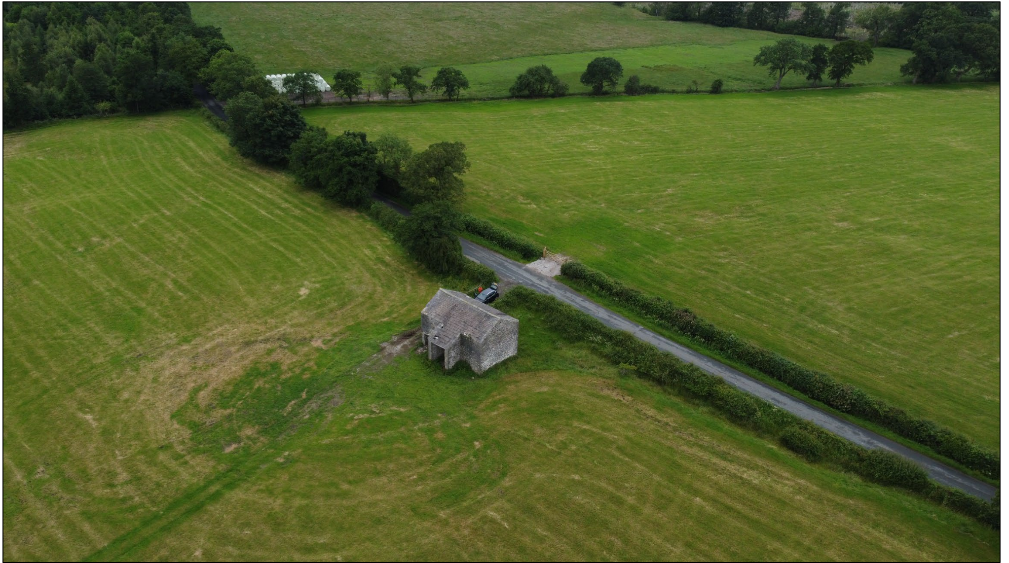
Figure 1b- Aerial view of the site (looking west)