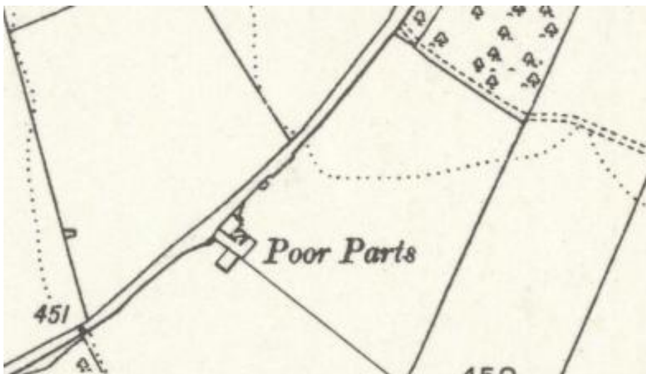
SD75 SE - A