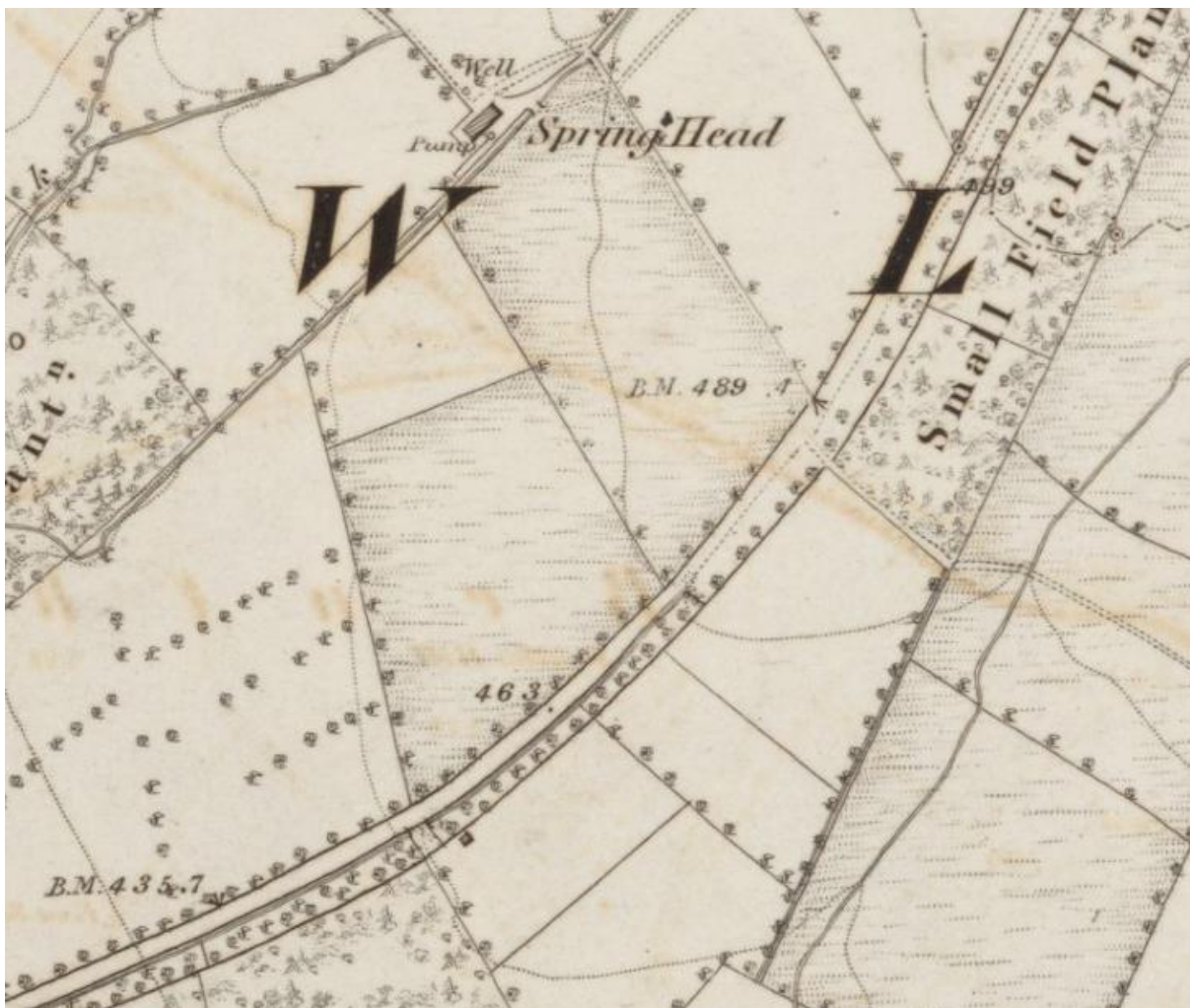
Yorkshire Sheet 166

Historical maps show that the building was constructed in the later part of the 19 th Century.