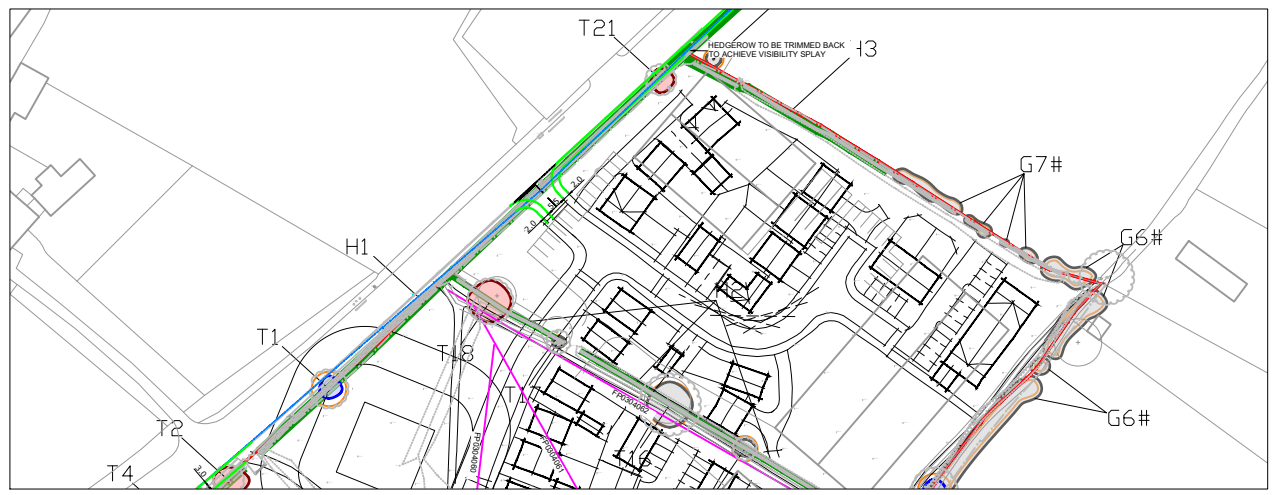
TREE SURVEY - SCALE 1:2000@A3