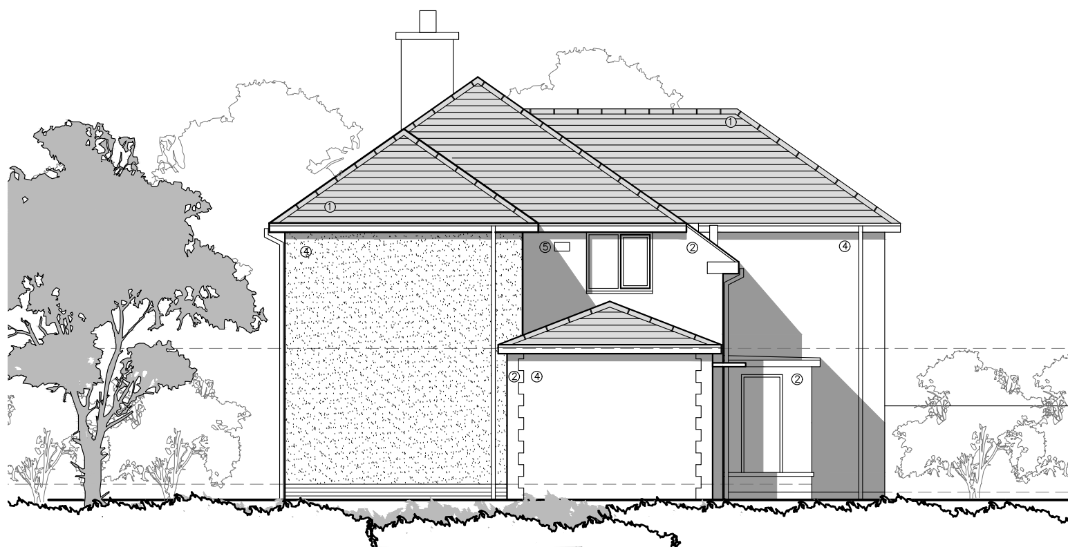
PROPOSED SIDE ELEVATION (2)

©aw+a architects ltd 2020 | This Drawing is to be read in conjunction with all other project associated drawings and information. Do not scale from this drawing. Report all errors, omissions and discrepancies to drawing author prior to construction or manufacture. This drawing is copyright and is the property of aw+a architects ltd