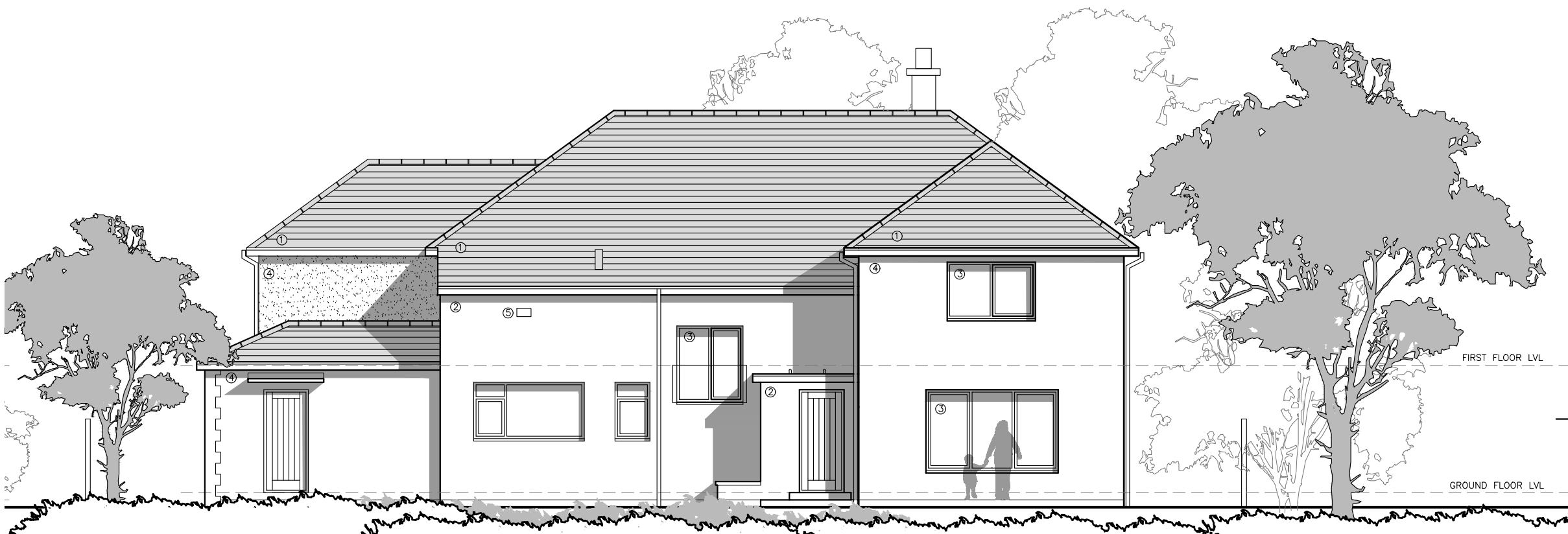
PROPOSED FRONT ELEVATION (1)