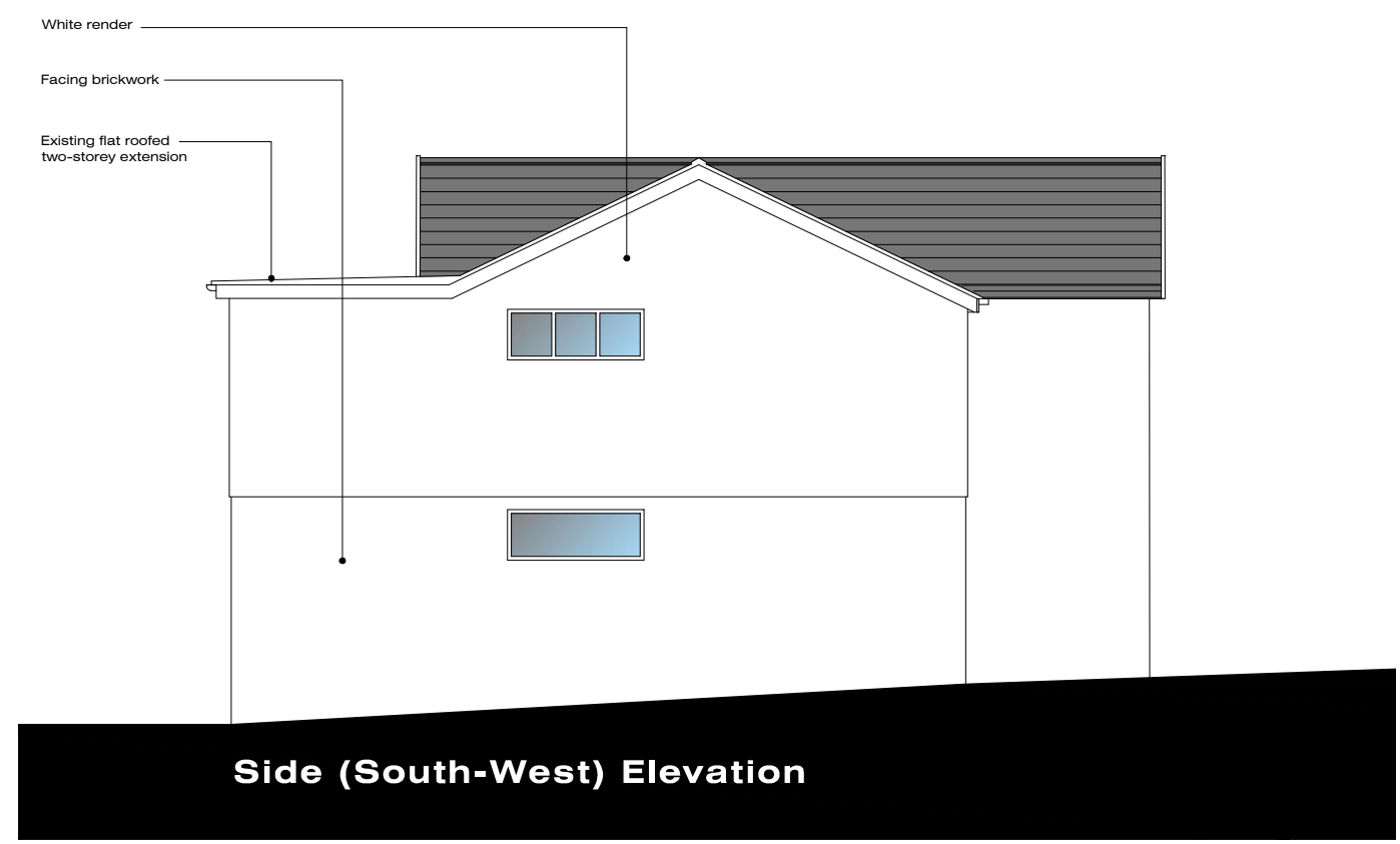
Side (South-West) Elevation