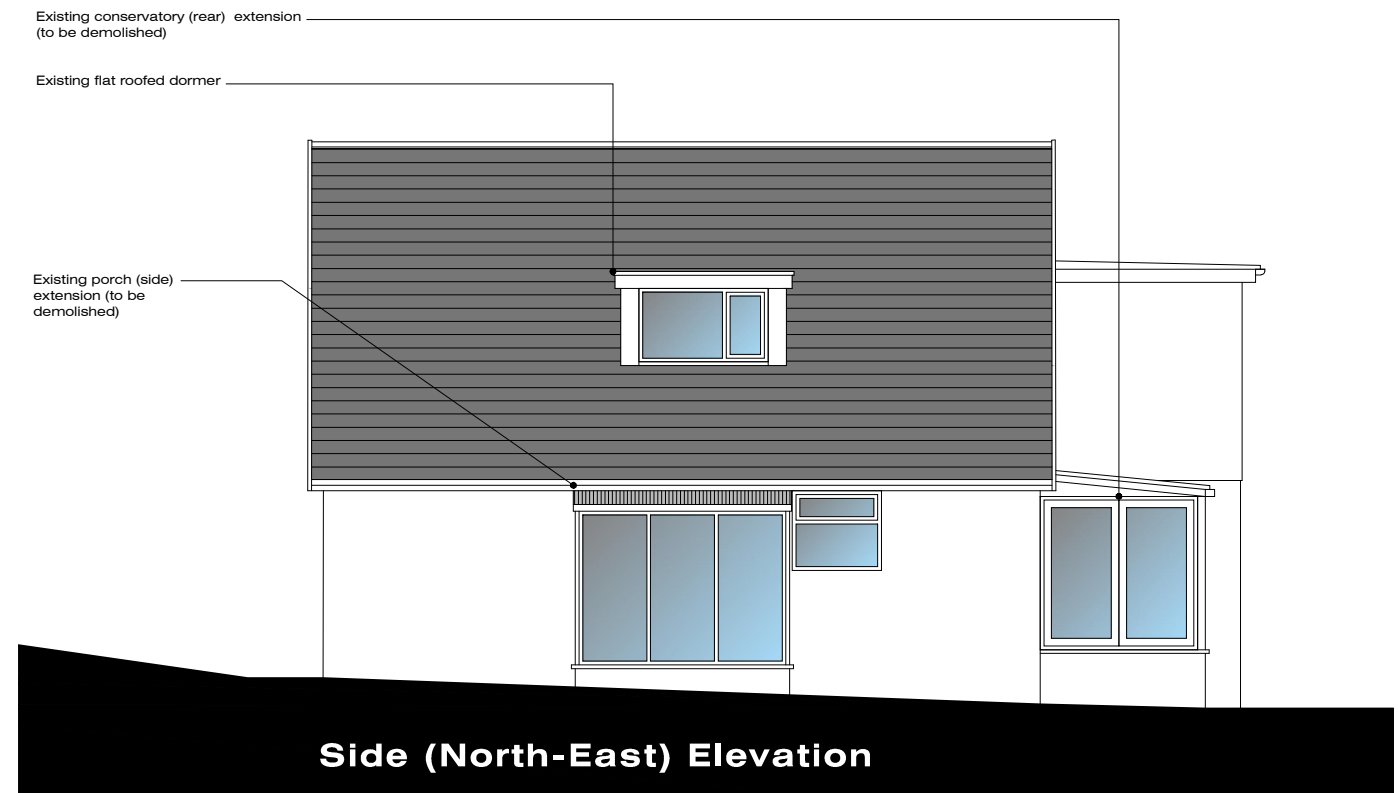
Side (North-East) Elevation