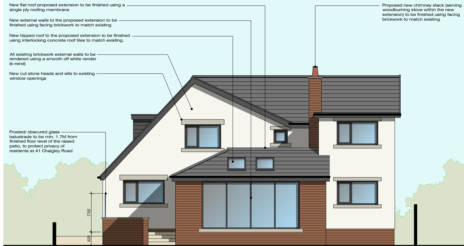
Rear (North-West) Elevation