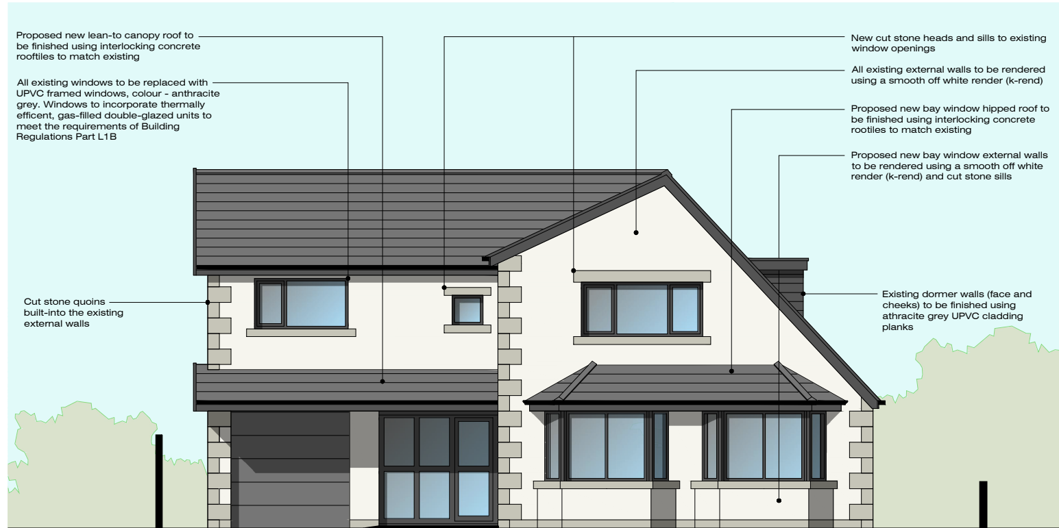
Front (South-East) Elevation

39 CHAIGLEY ROAD - LONGRIDGE - PRESTON - PR3 3TQ