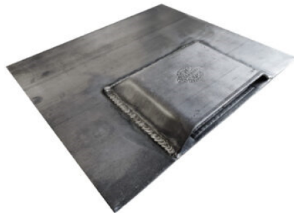
Access points will be fabricated from Code 4 lead sheet, milled to BS EN 12588 by Leadworx.