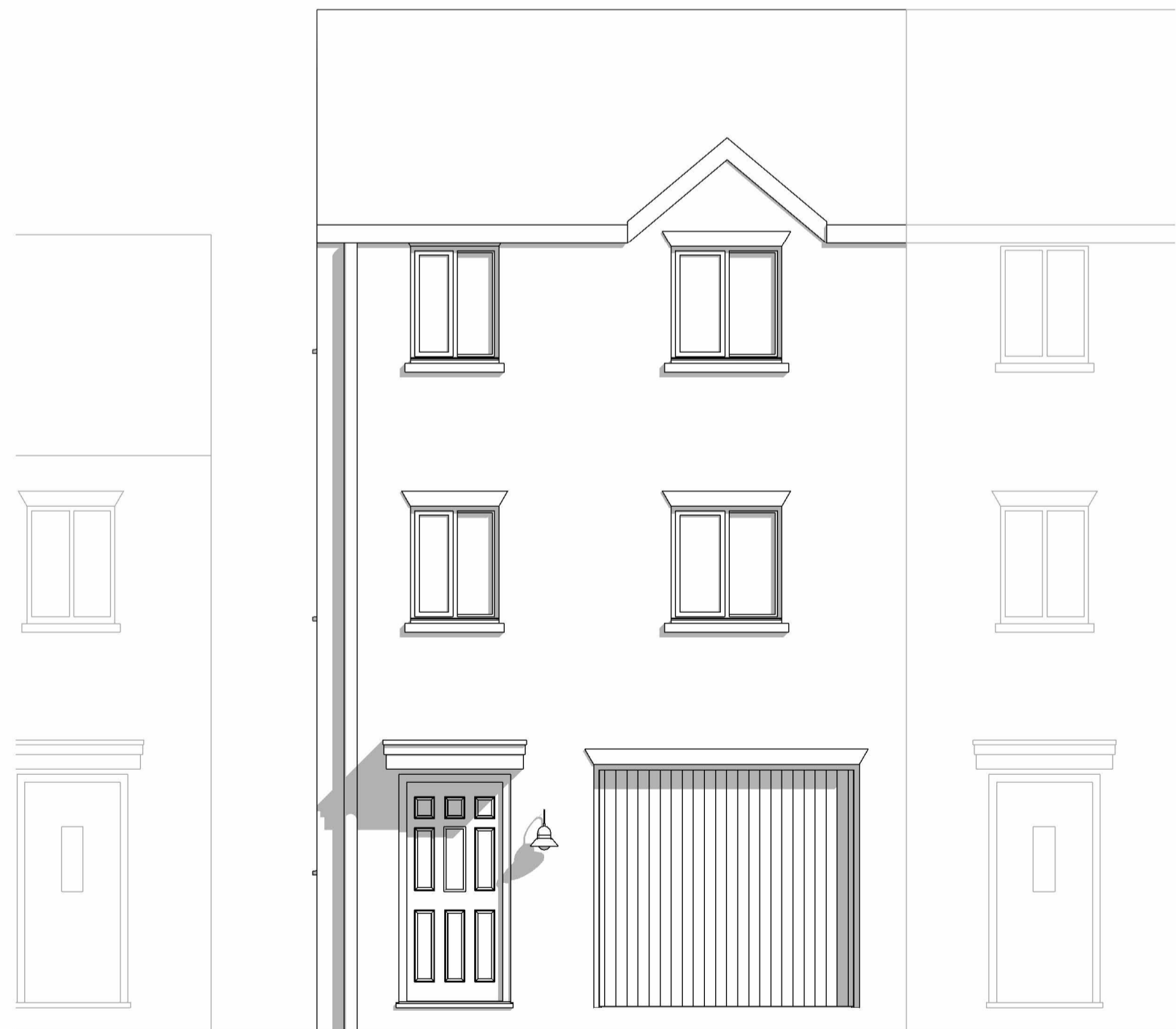
1 NORTH EAST 1 : 50