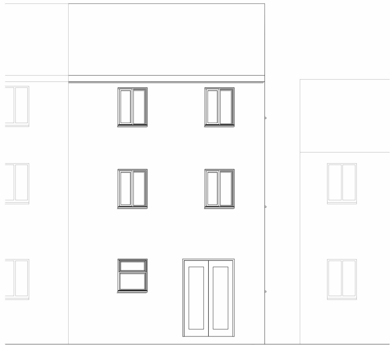
4 SOUTH WEST 1 : 50