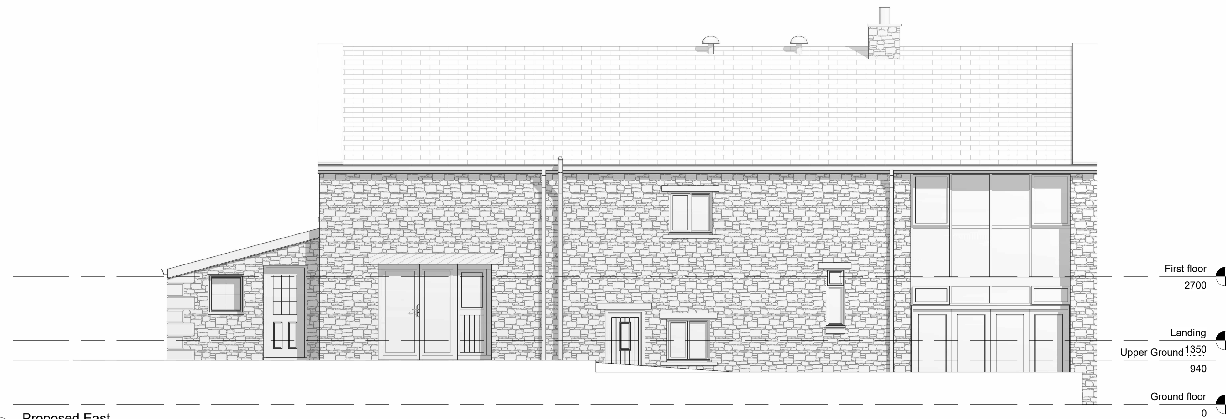
1 Proposed East. 1 : 50