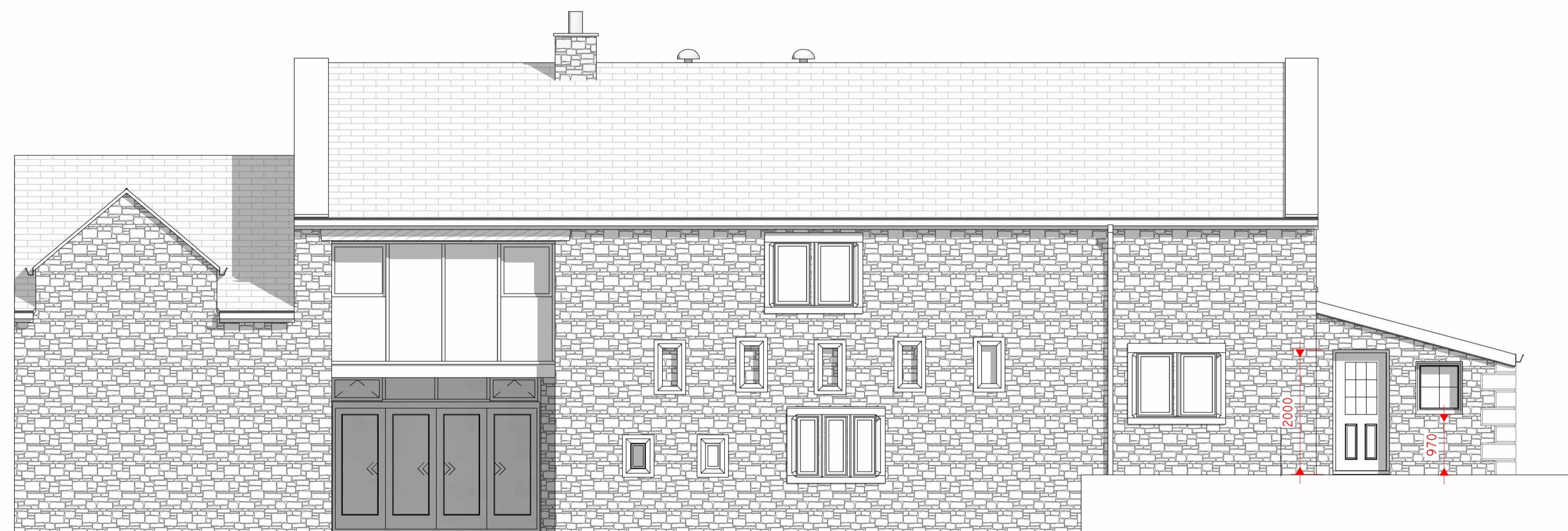
4 Proposed West. 1 : 50