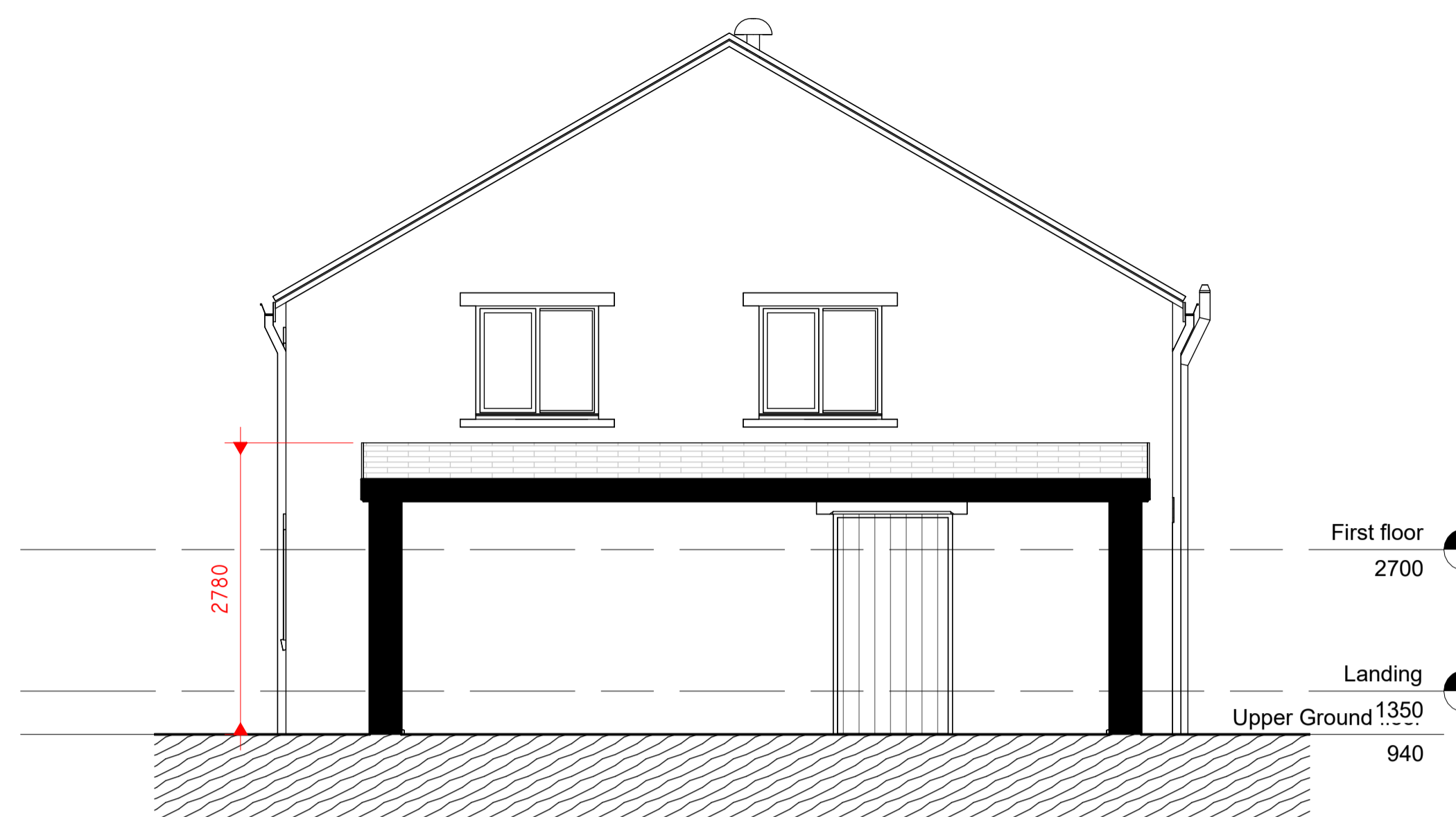
3 Section 8 1 : 50