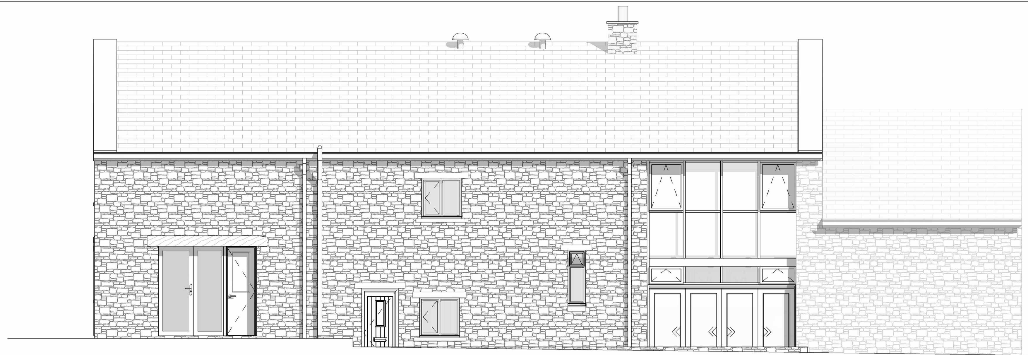
2 Existing East 1 : 50