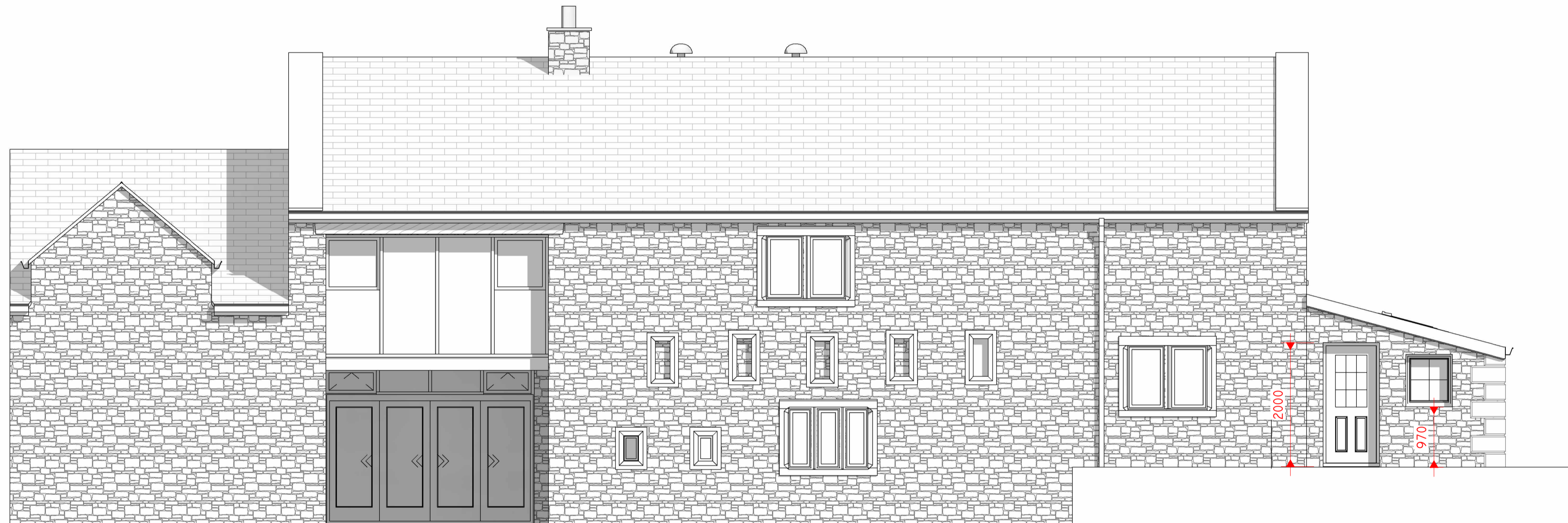
4 Proposed West. 1 : 50