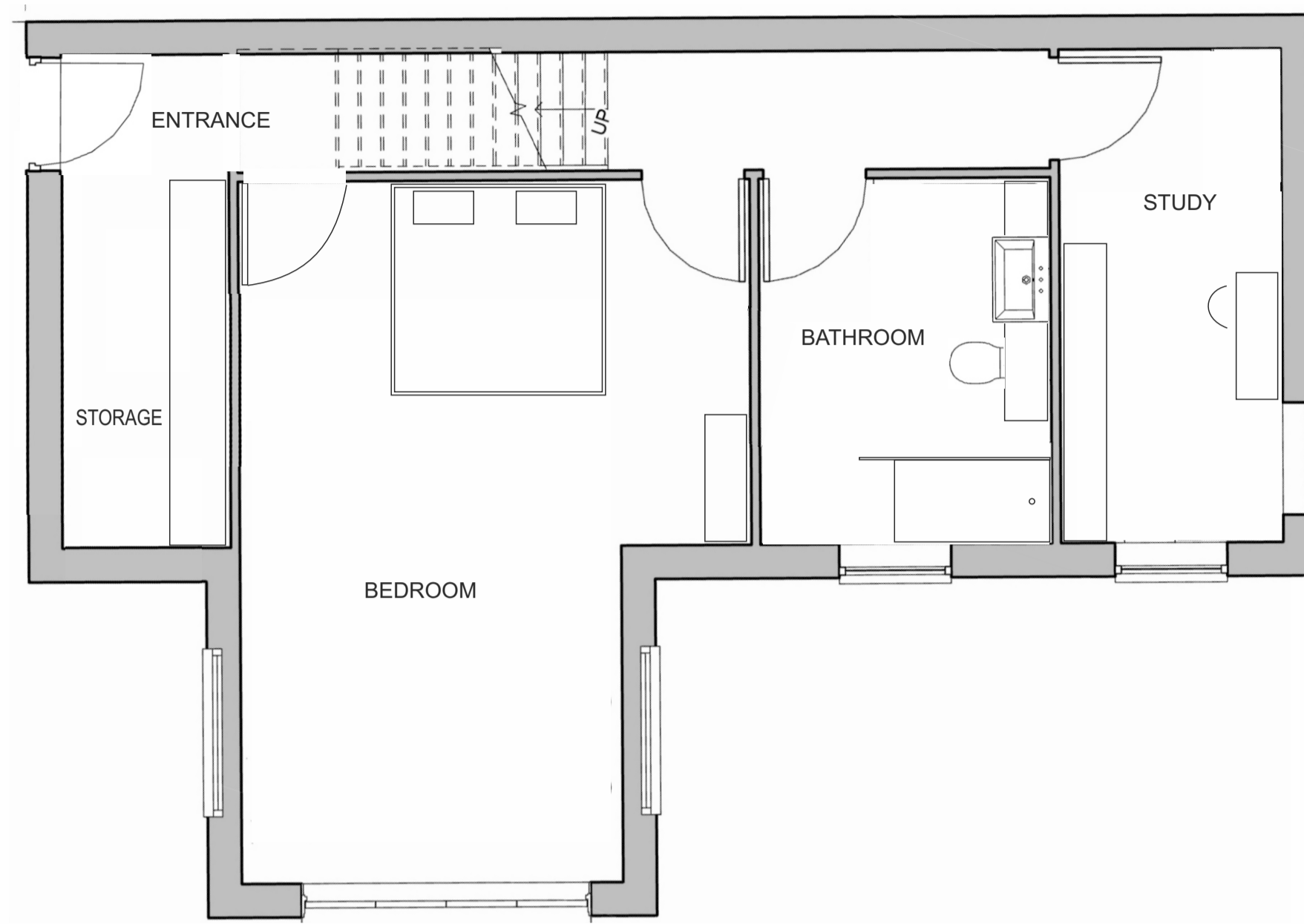
(1) ANNEX GROUND FLOOR