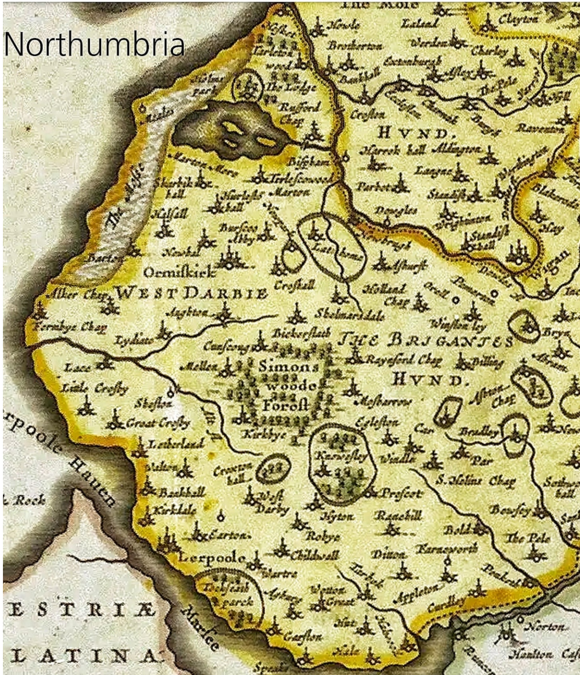
Fig 02: Map Stonyhurst, Lancashire (1646)