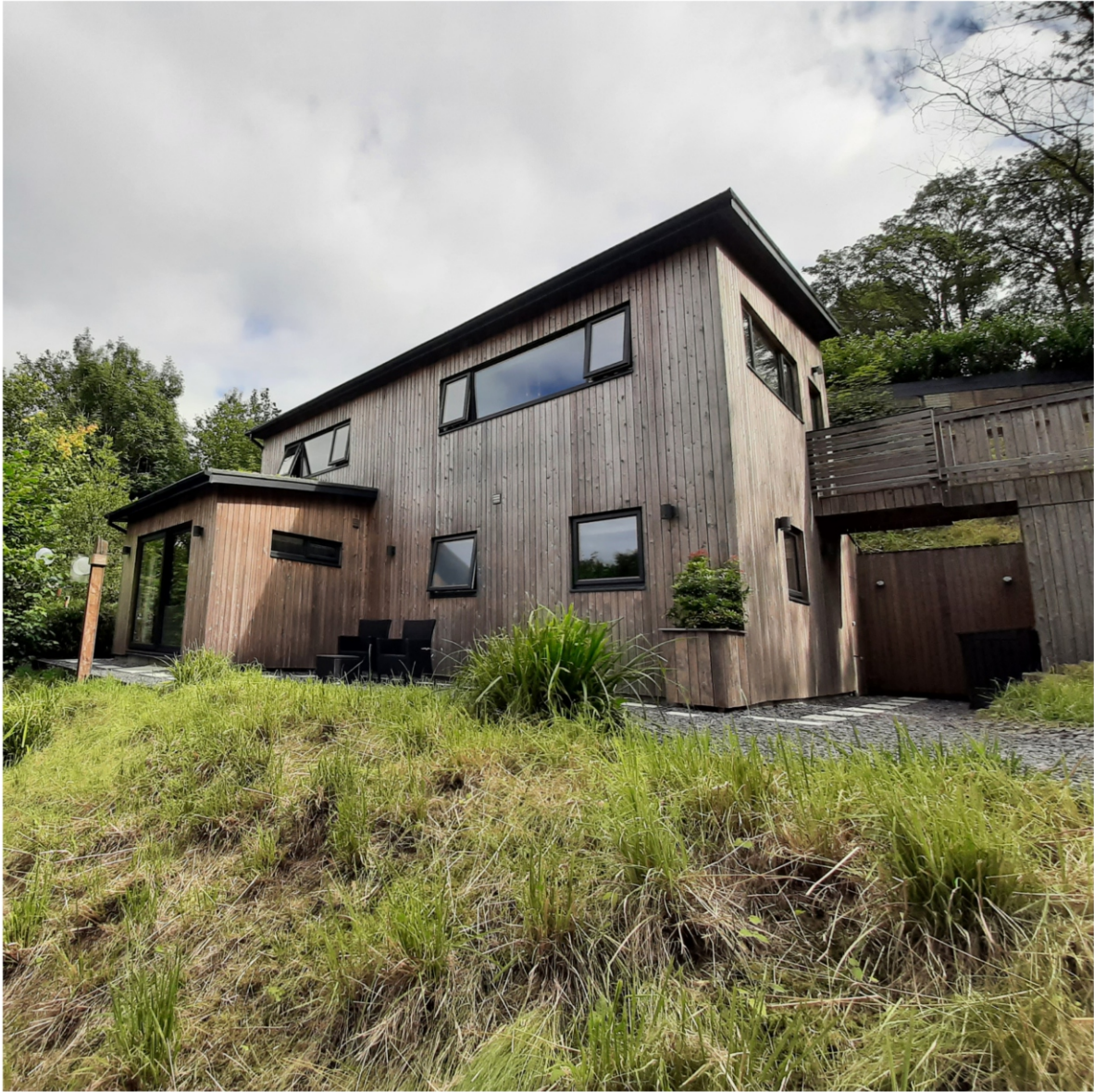
Annex: Natural Timber Cladding.