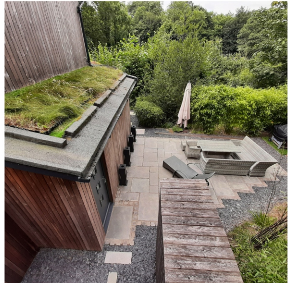
Green Roof: Biodiversity increasing species populations.