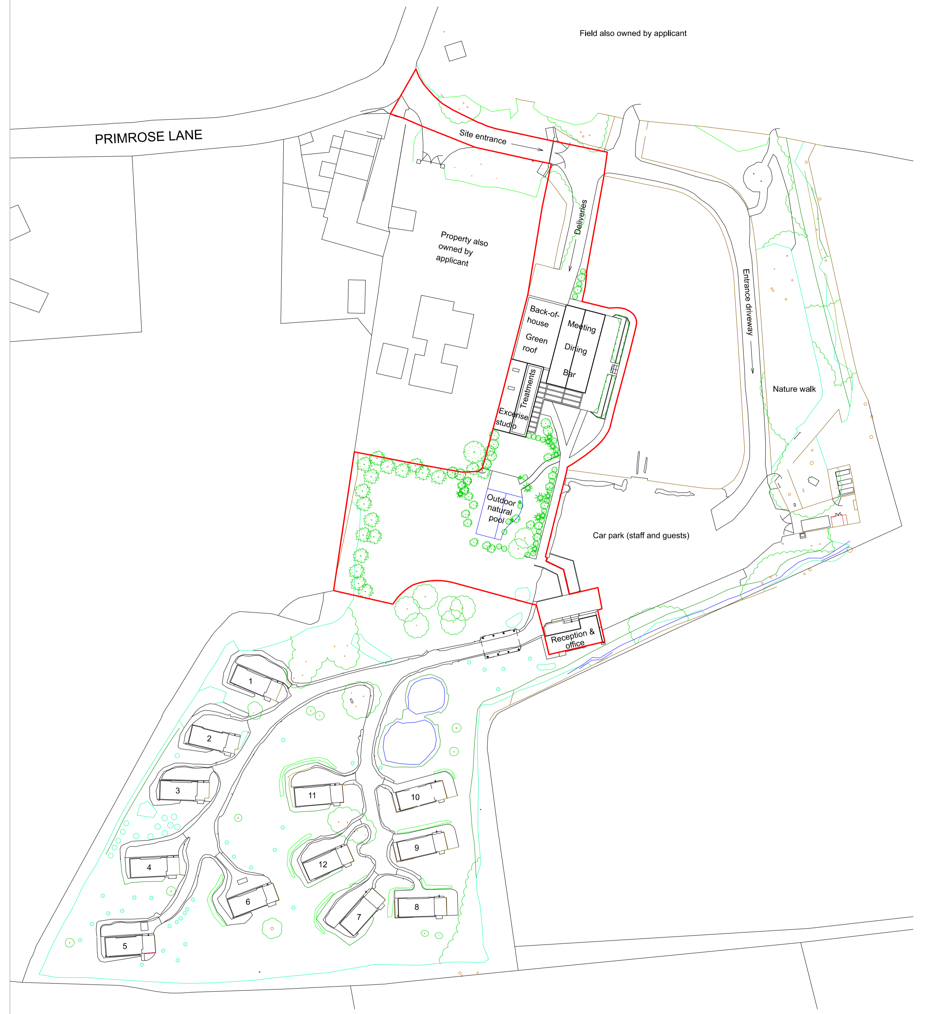
Proposed Site Plan Scale 1:500