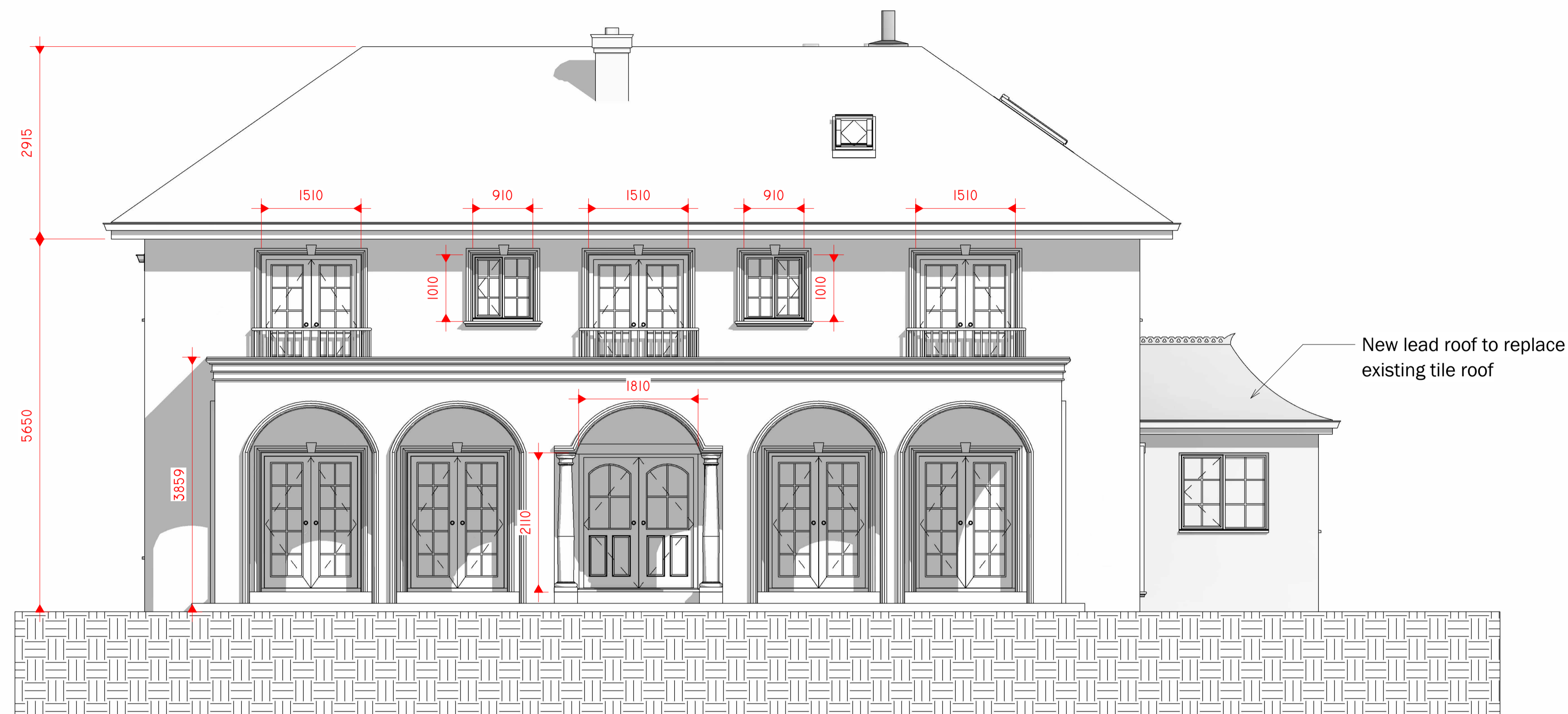
1 PROPOSED WEST