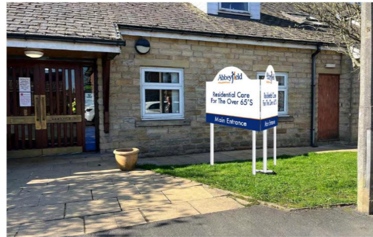
Residential Care Home Sign Visual