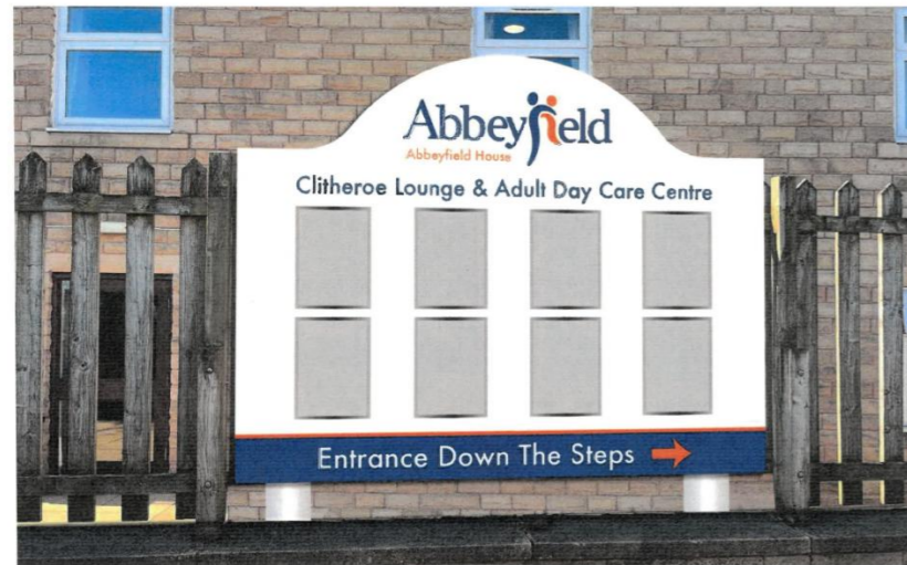
Entrance Down The Steps Sign Visual