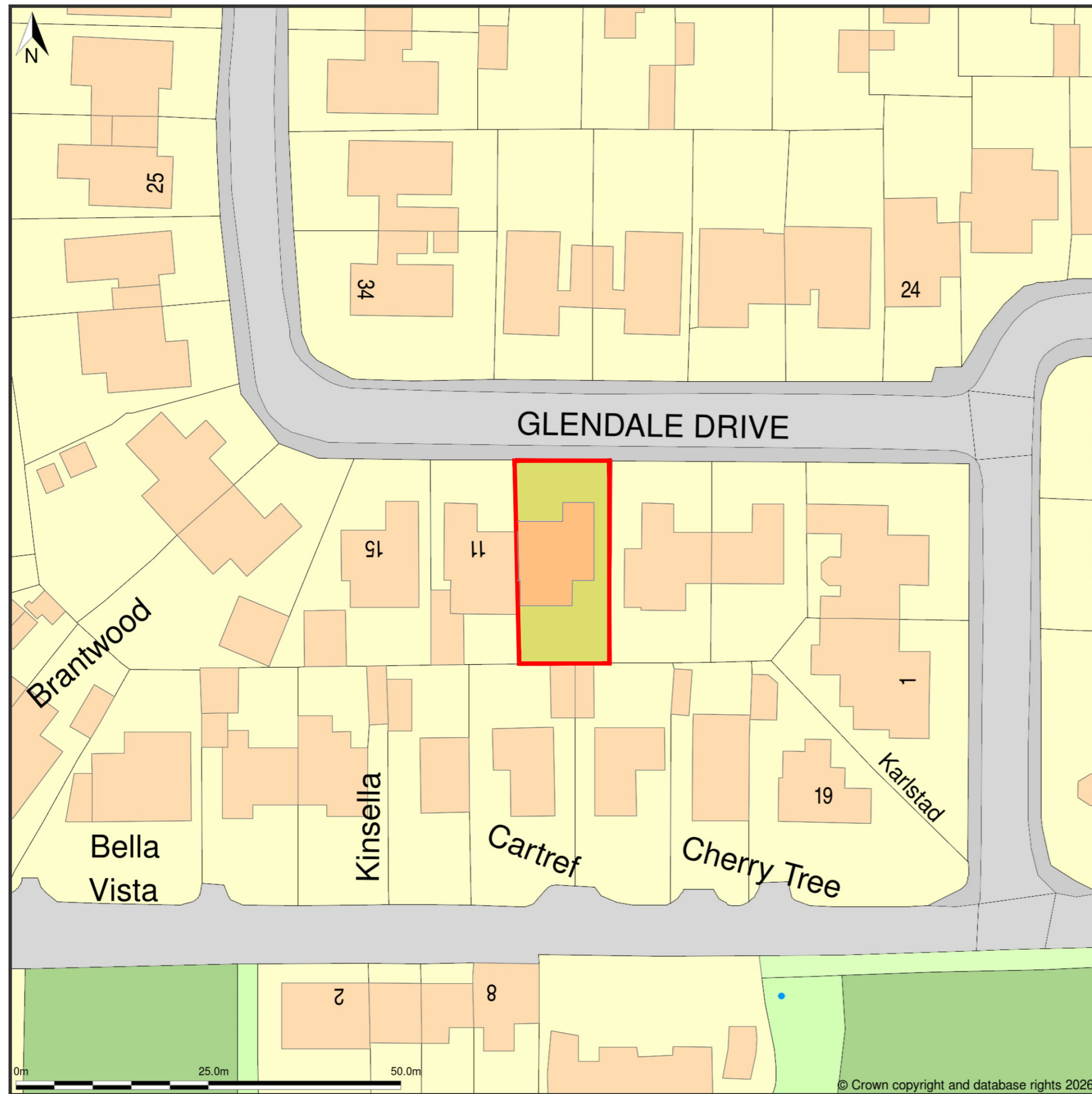
EXISTING SITE PLAN 1:500