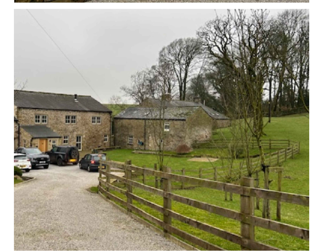
Photos of Existing trees