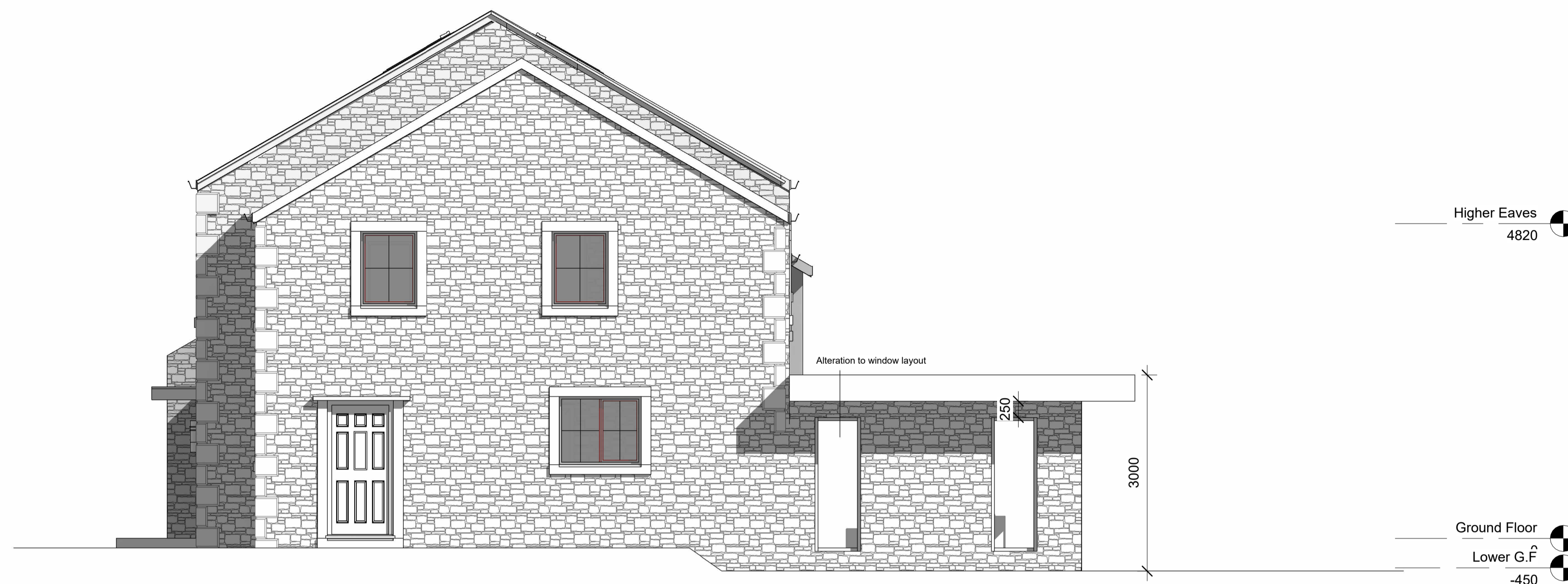
1 PROPOSED NORTH 1 : 50

For the variation of conditions application only.