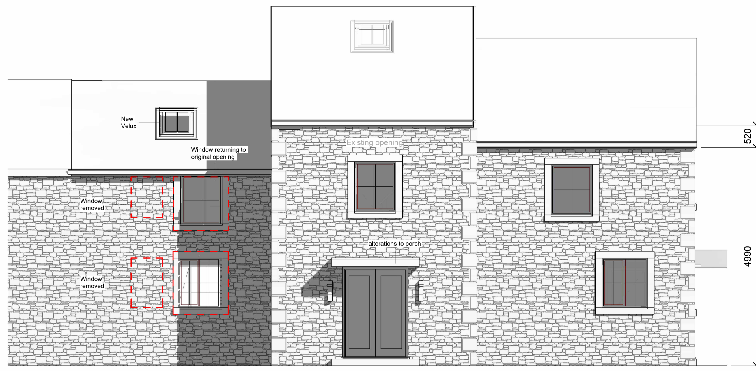
2 PROPOSED EAST 1 : 50

For the variation of conditions application only.