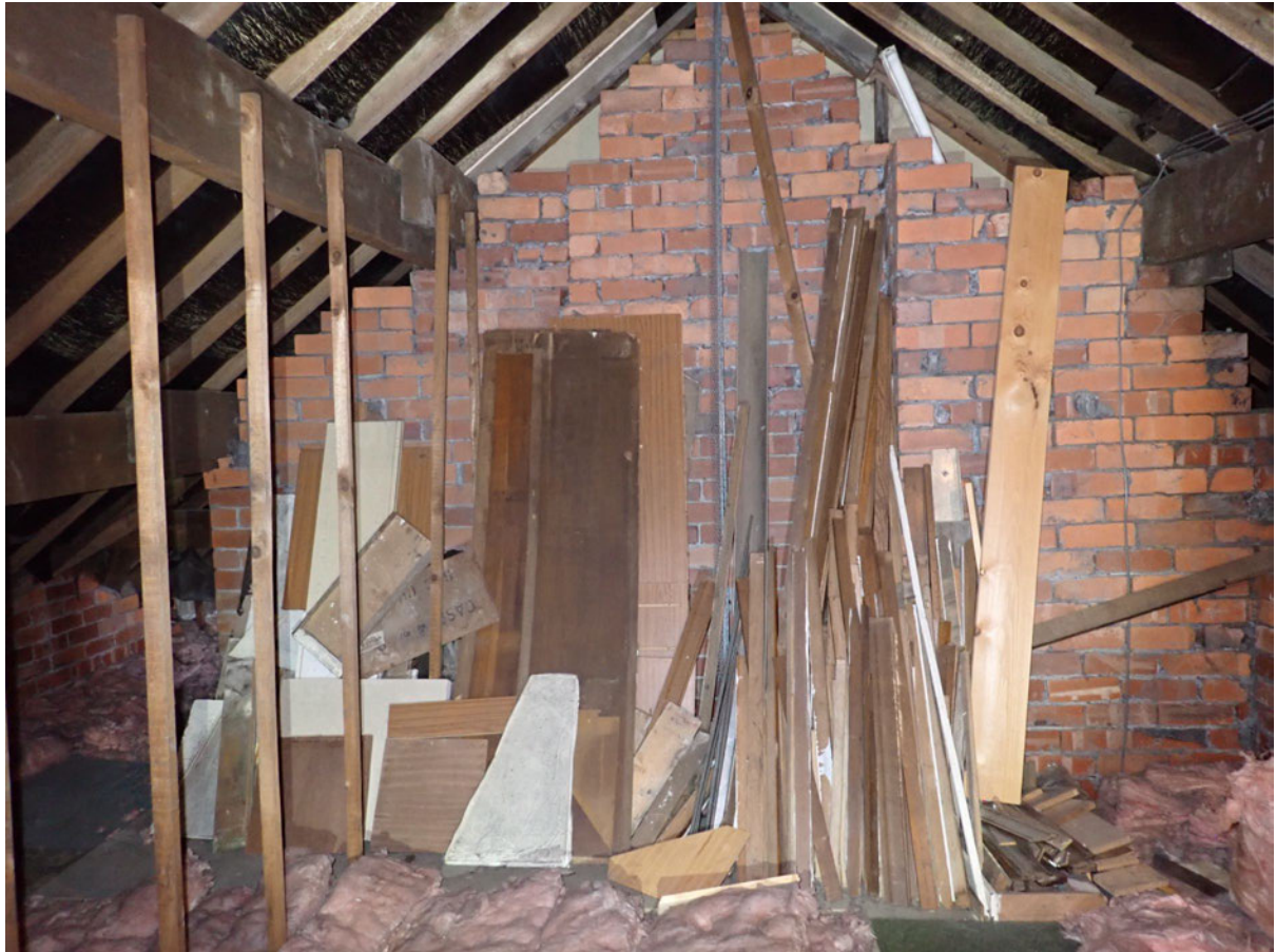
9 – The house has a single roof void.