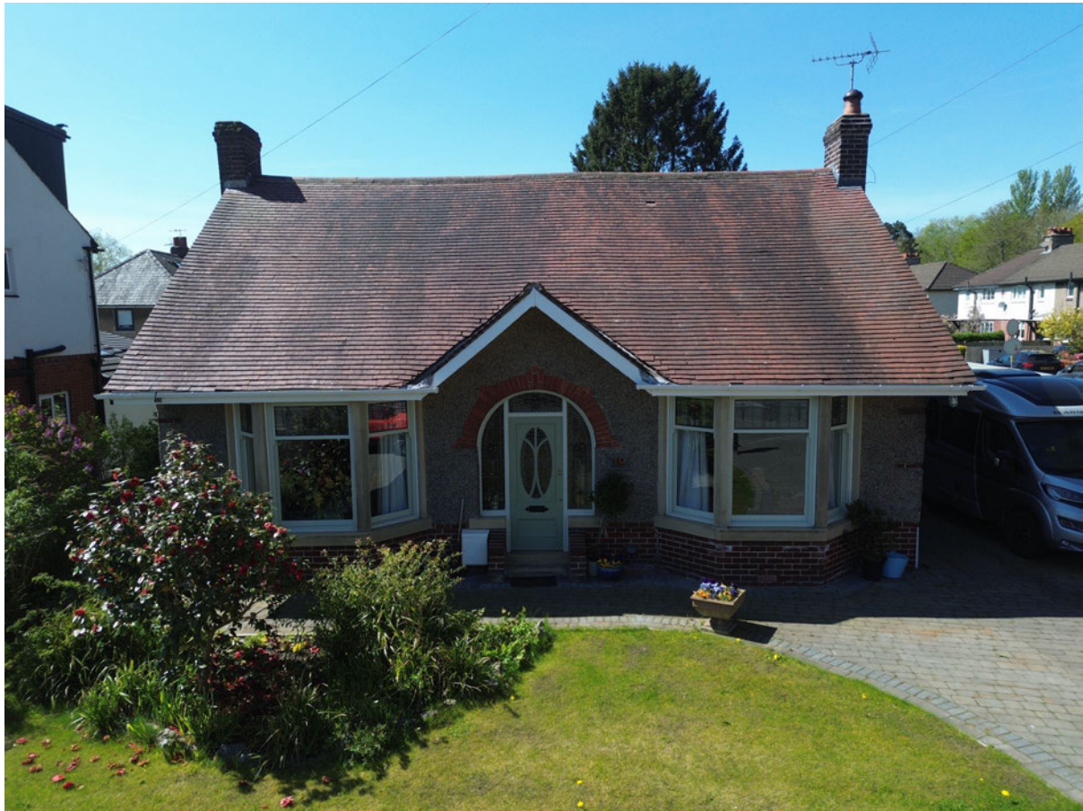
3.1a – The front of the house.

Nº79 Mitton Road, Whalley, is a pre-1950's built detached bungalow, which is currently occupied. It has a pitched roof, covered with plain clay roof tiles and ceramic ridge tiles. A ground floor extension and garage to the rear have flat felt-covered roofs.