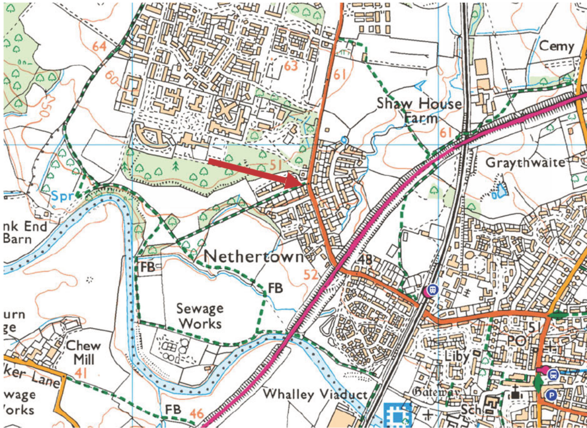
1.6a – 79 Mitton Road – site location.