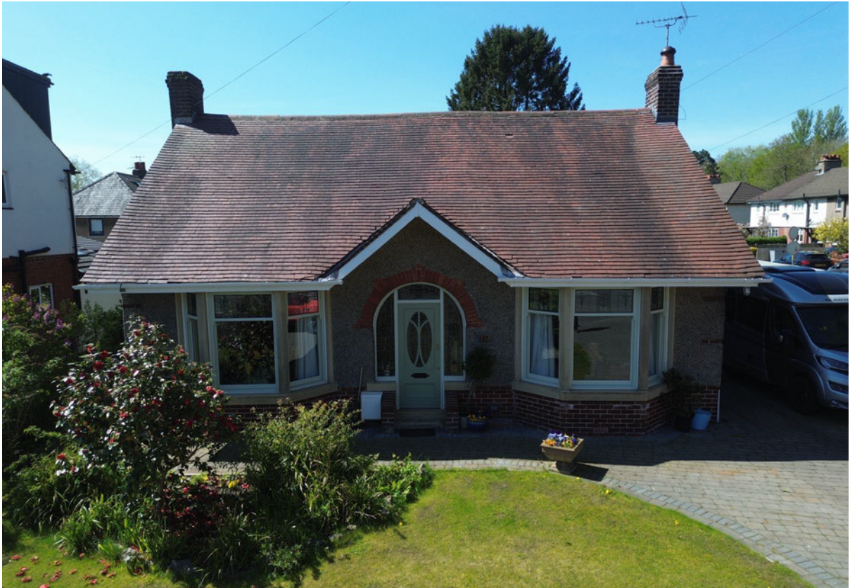
1 – The front of the house.