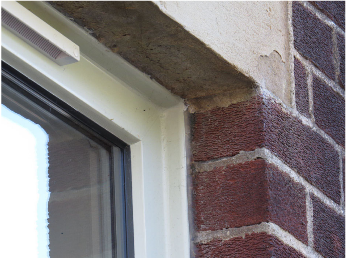
7 – Window and door frames are tightly sealed into brickwork with no suitable gaps.