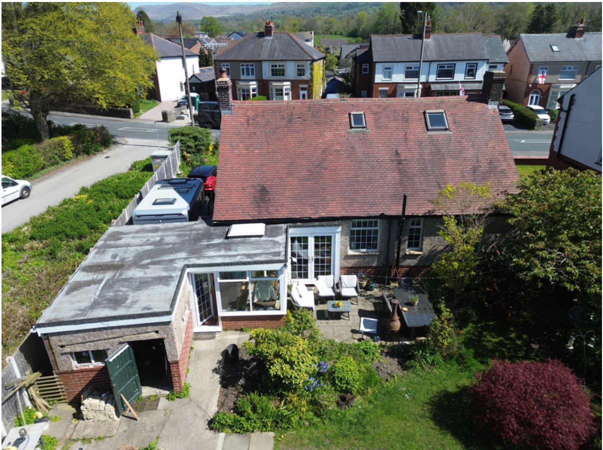
2 – The rear of the house.