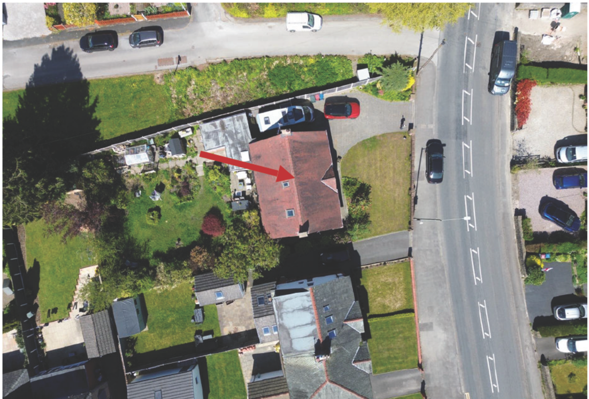
1.6b – 79 Mitton Road – aerial photograph.