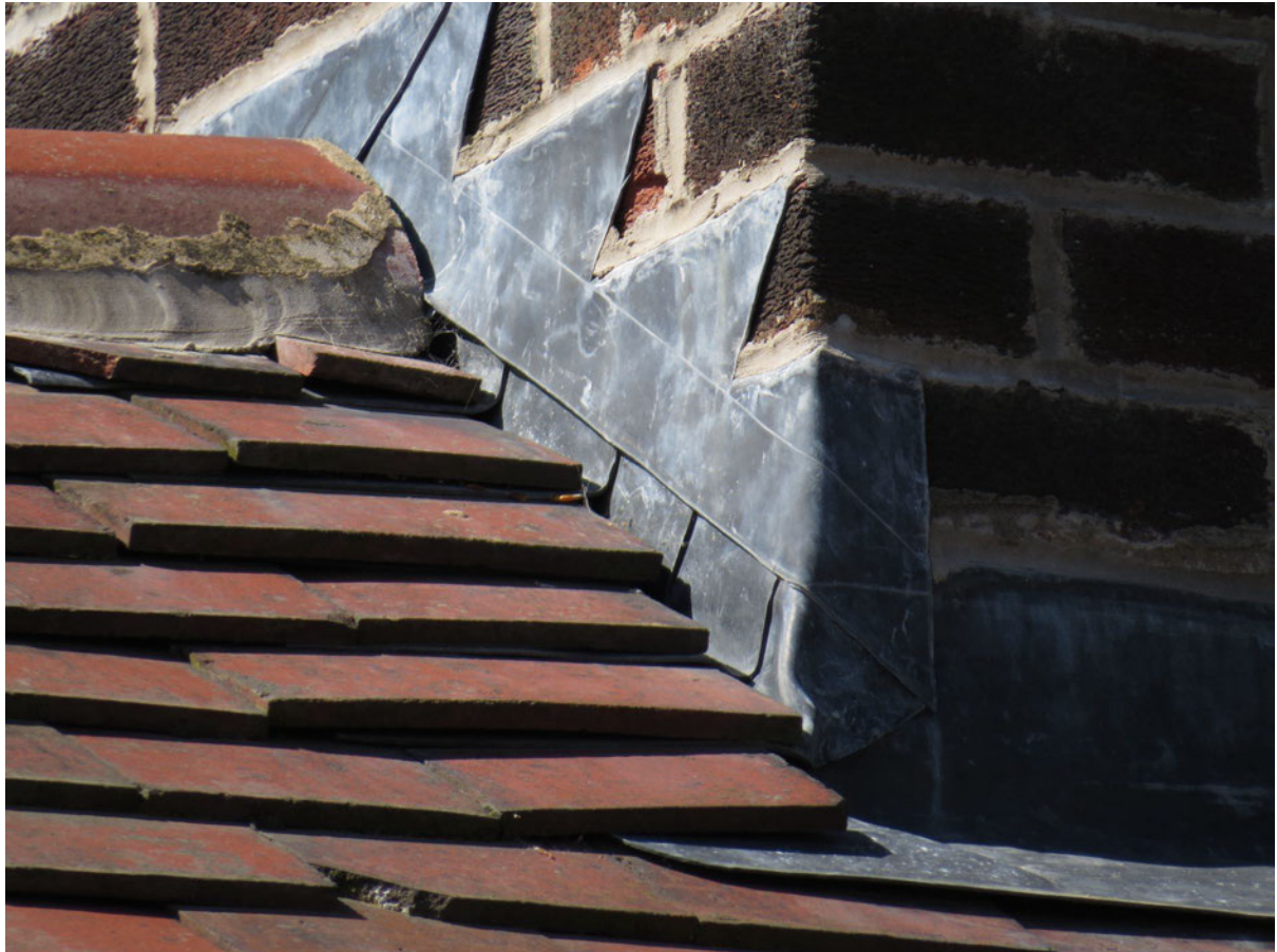
5 – Lead flashing is fitted tightly with no suitable gaps.