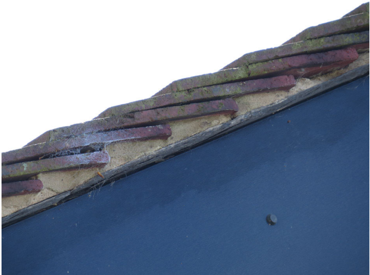
8 – End tiles at the verges are sealed with cement.