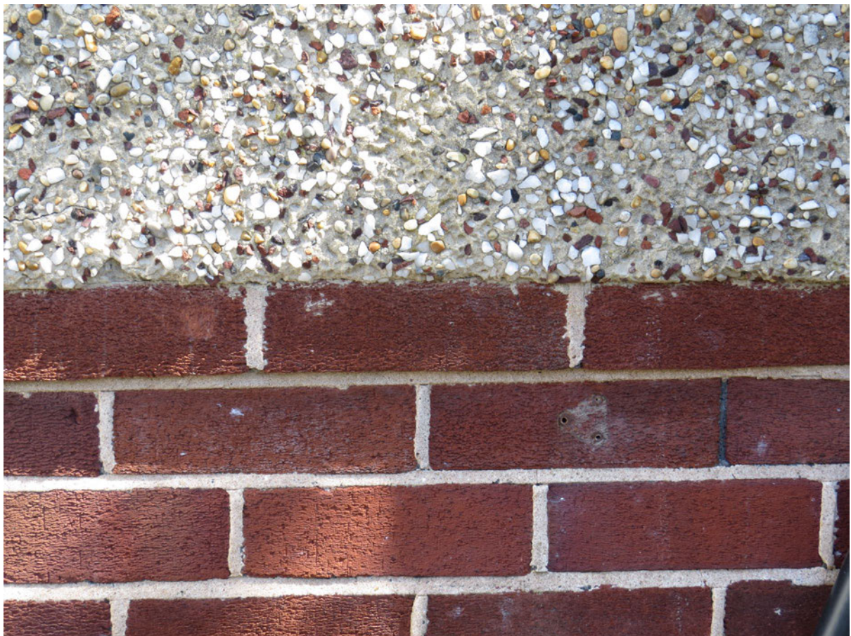
6 – Brickwork and render are in good condition with no suitable gaps.