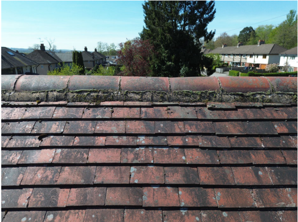
3 – Roof and ridge tiles are in good condition with no suitable gaps.