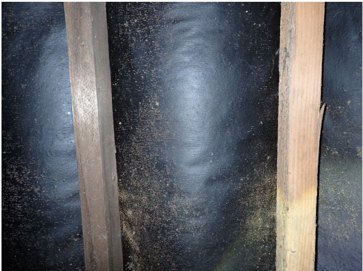
10 – Roof lining is in good condition with no gaps or tears.