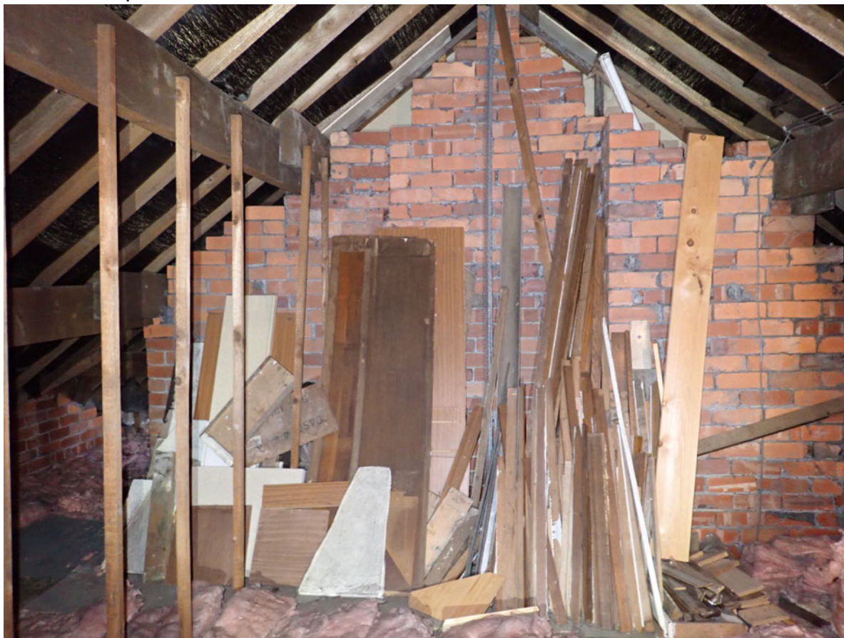
3.2a – The roof void.

The house has a single roof void, which is used for storage, and accessed infrequently for essential maintenance work.