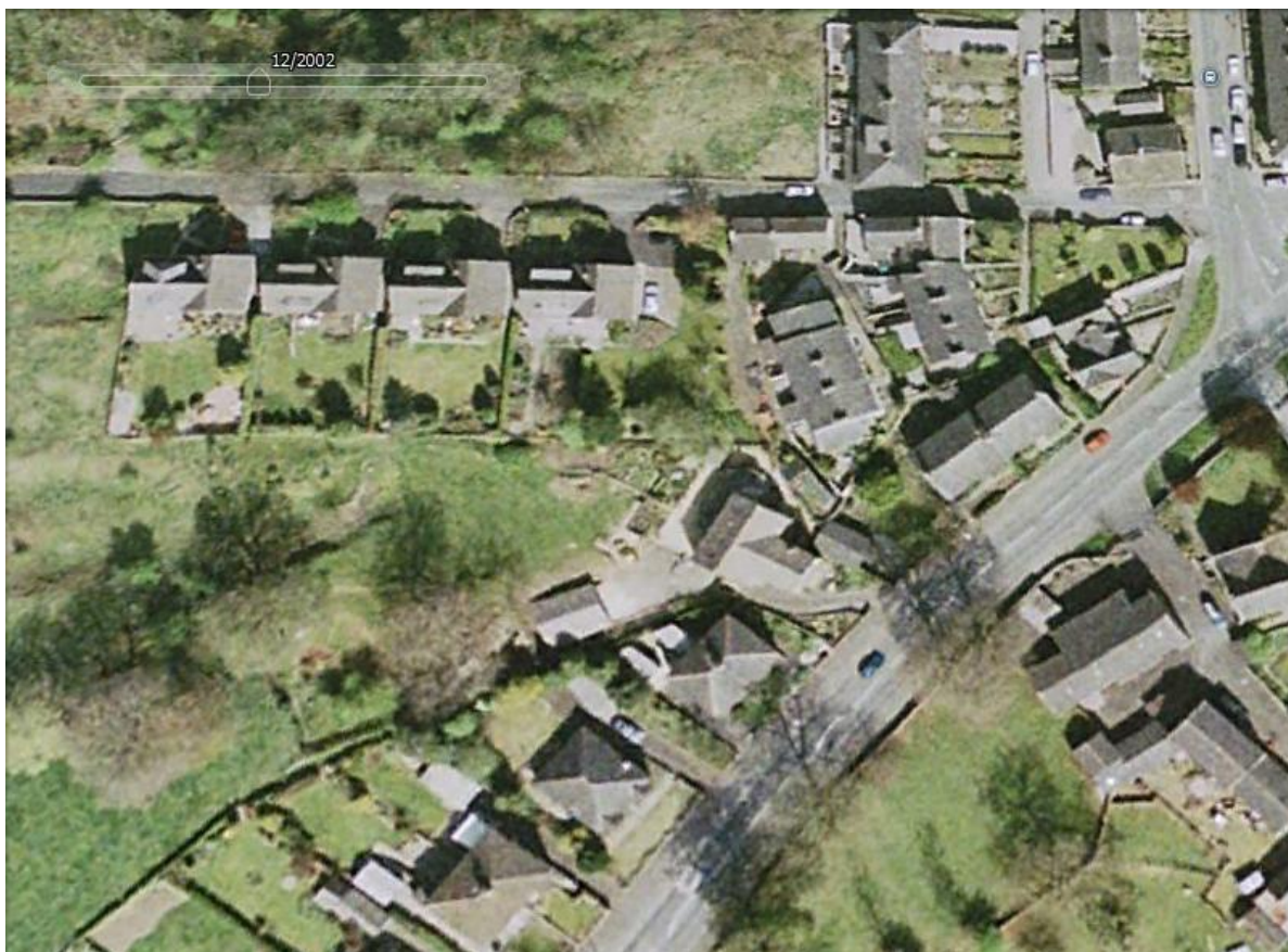
1. Google earth image 2002 Garage