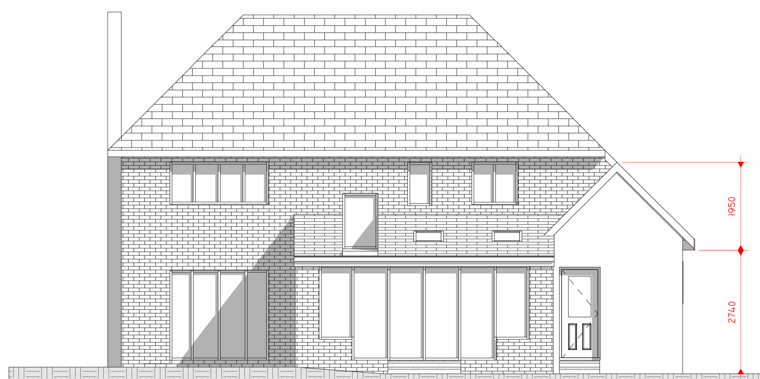
5 EXISTING NORTH-WEST 1 : 50