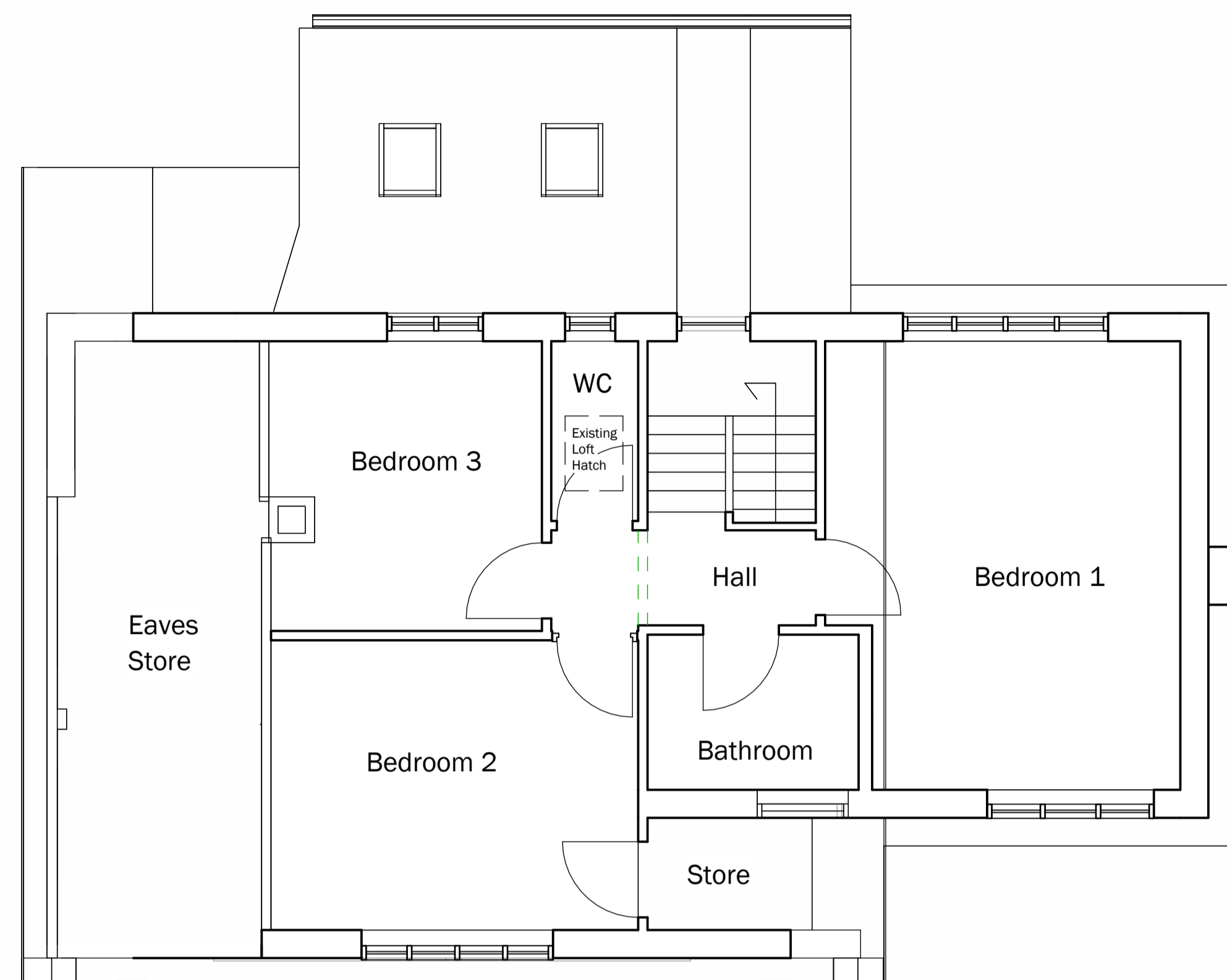
1 1 FIRST FLOOR 1 : 50