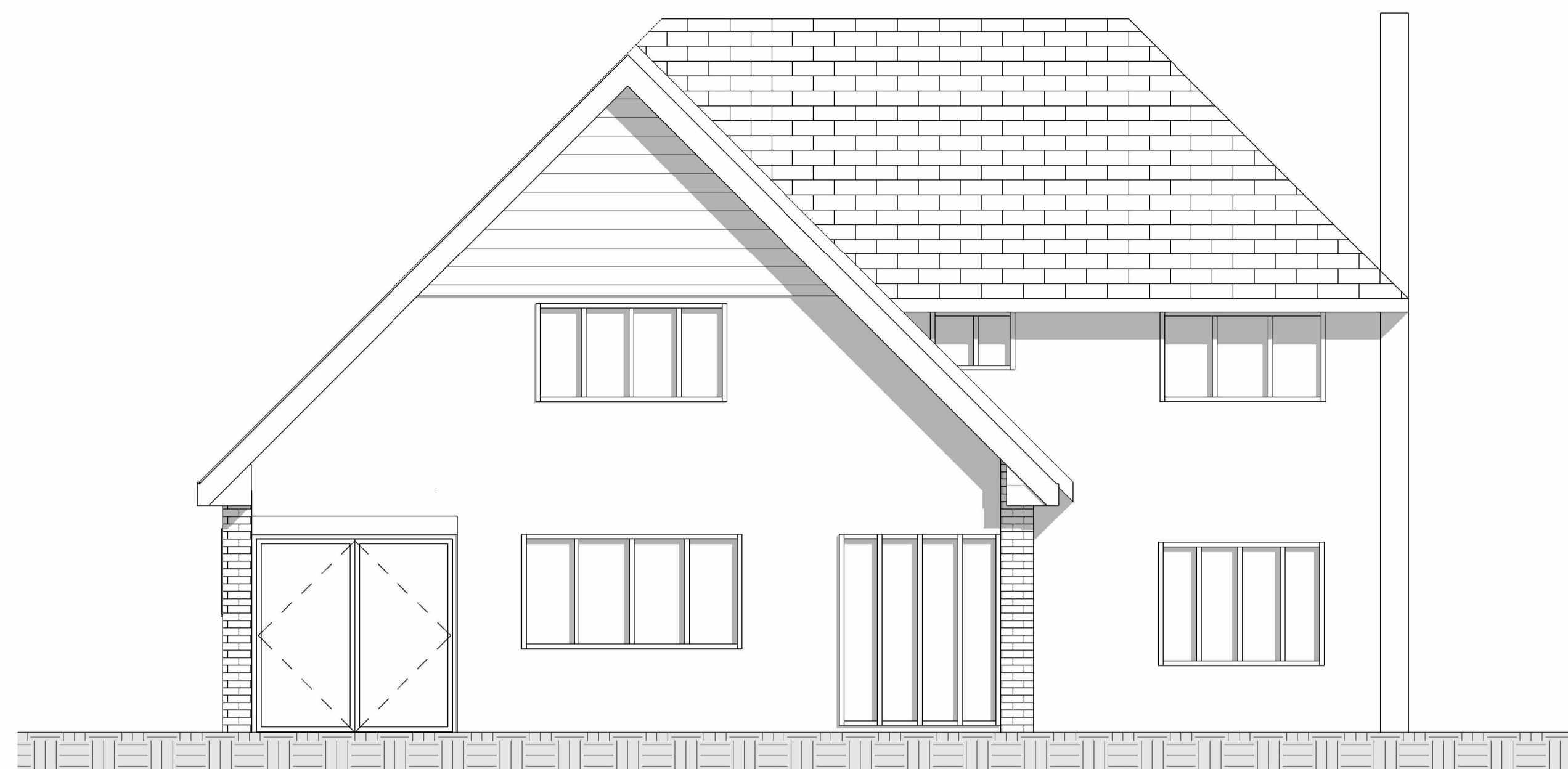
4 EXISTING SOUTH-EAST 1 : 50