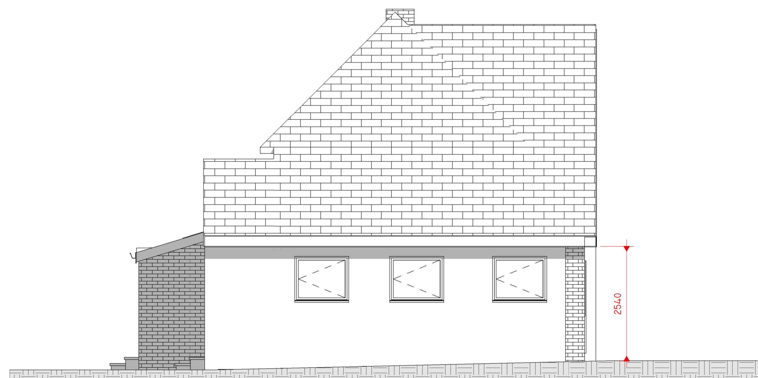
3 EXISTING SOUTH-WEST 1 : 50