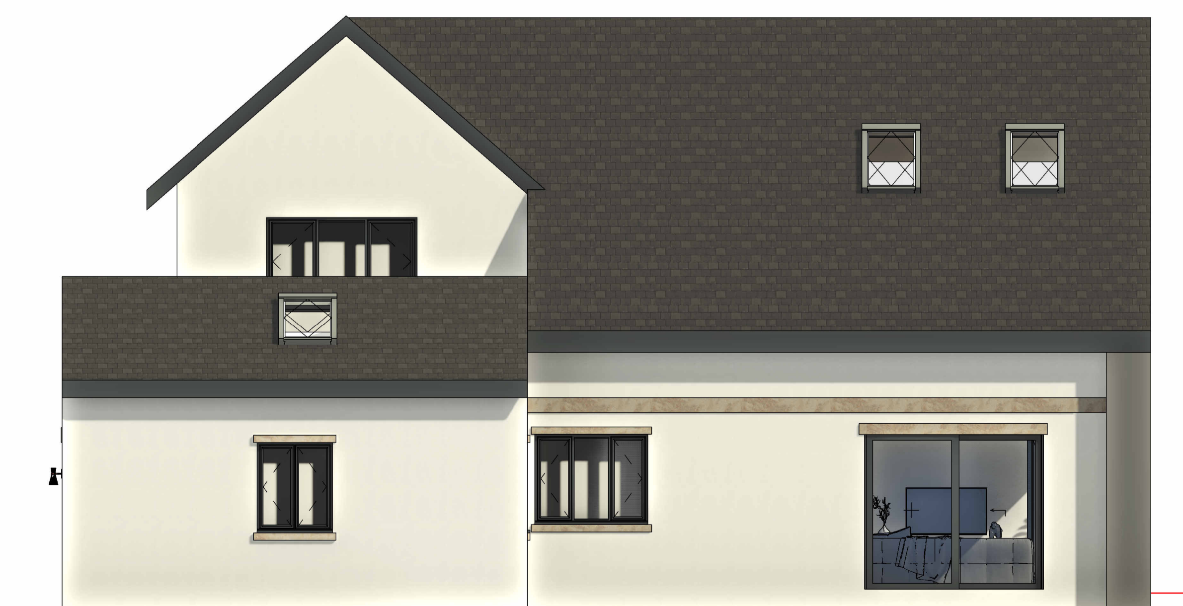
3 PROPOSED EAST