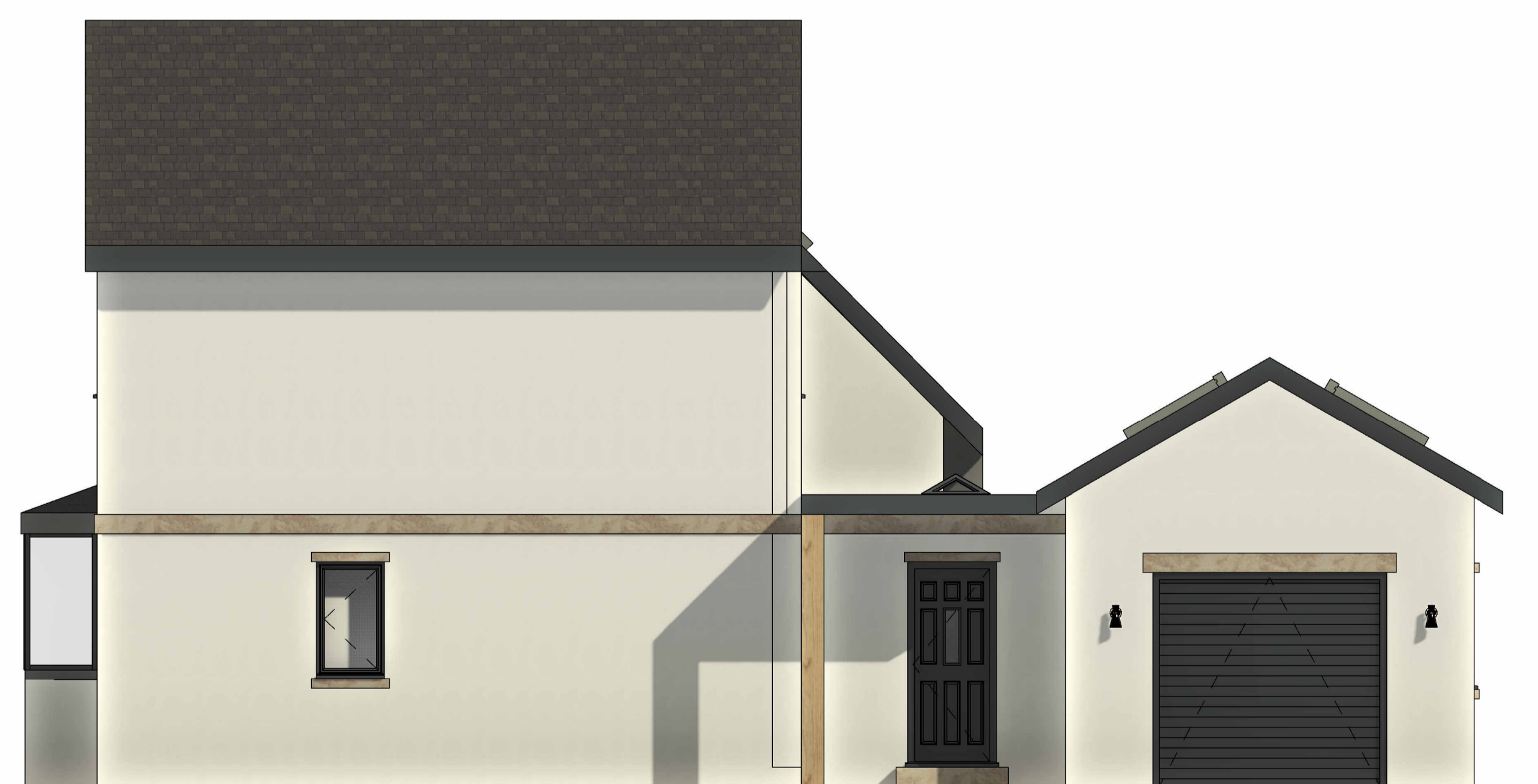
4 PROPOSED NORTH