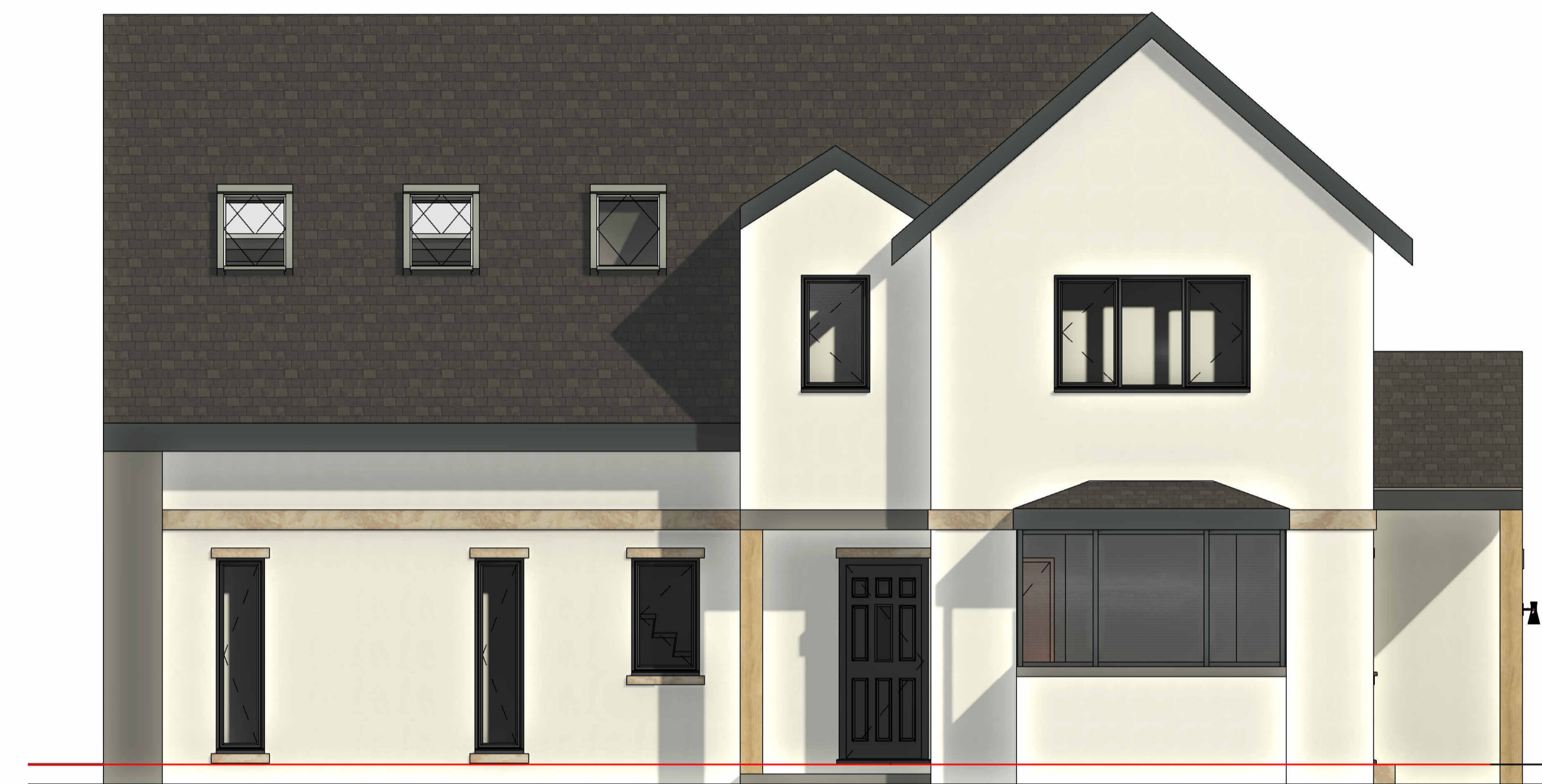
2 PROPOSED WEST