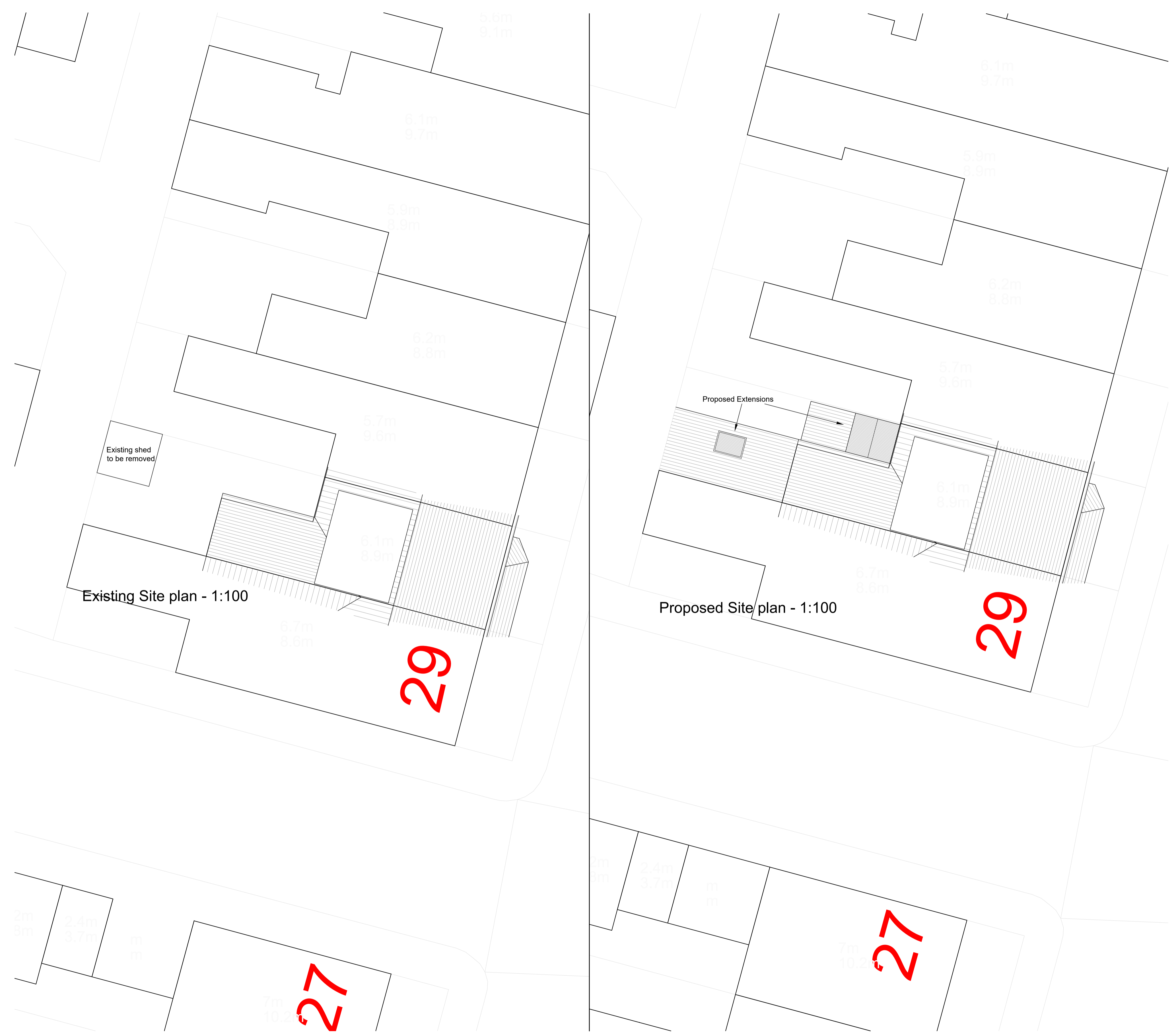
Existing Site plan - 1:100