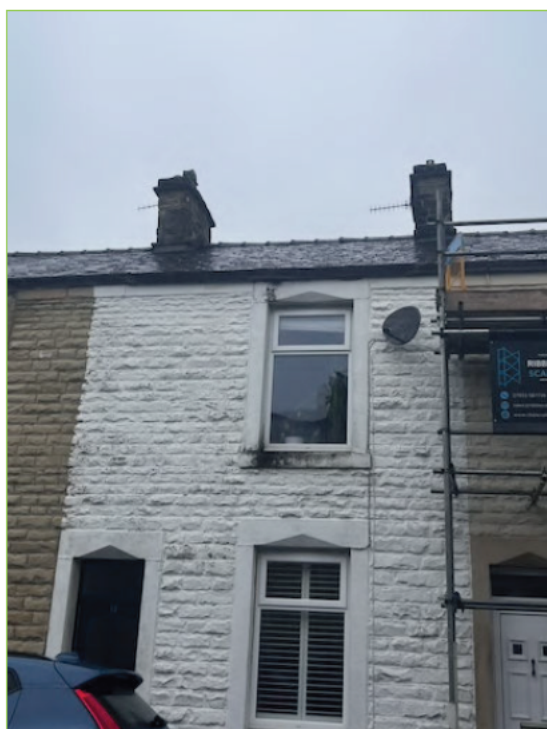
The front (east) elevation of the house