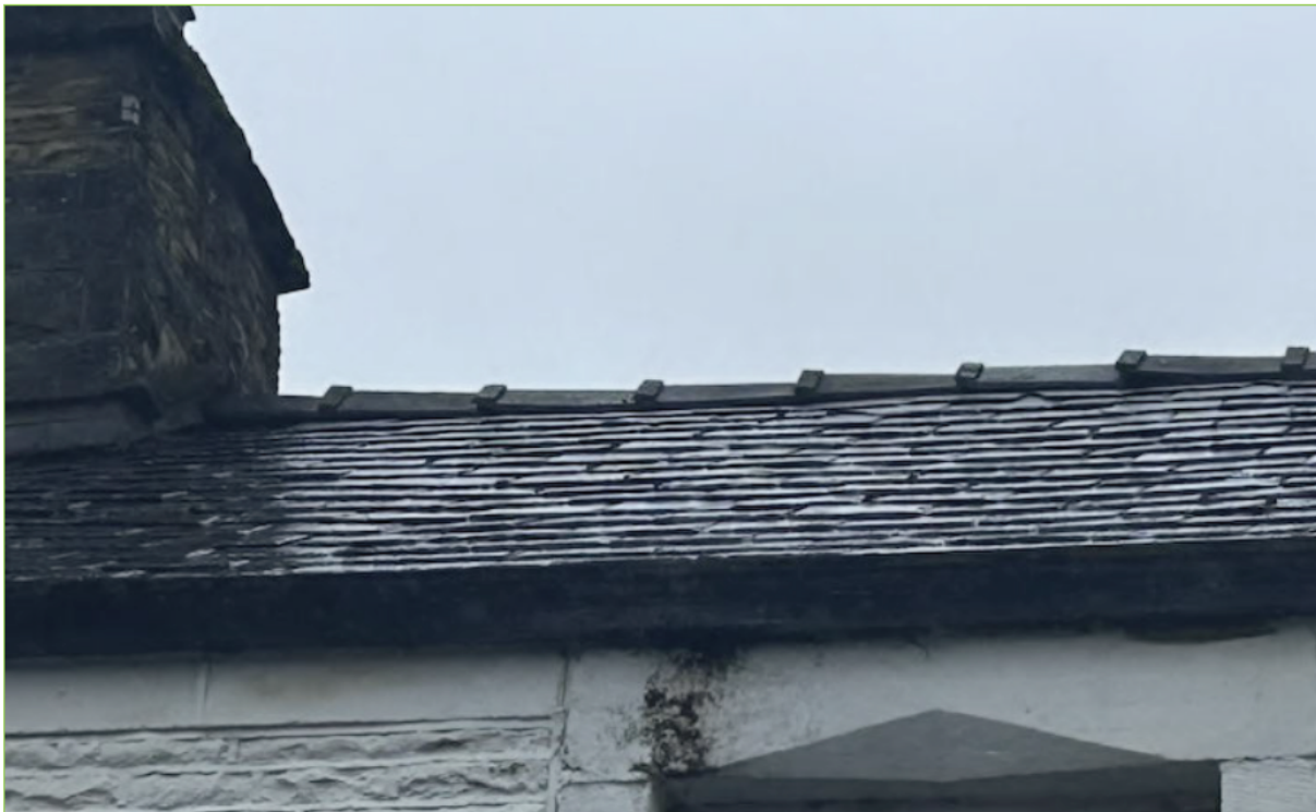
Showing small crevices under uplifted slates on the east elevation of the roof