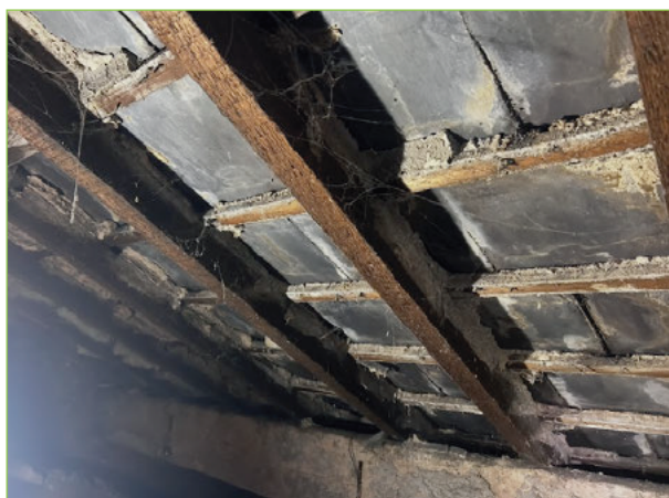
Showing the unlined slates and cobwebs across the underside in the loft void

7.2.5 Overall, the house is considered to have negligible suitability for bats. The proposals to install the solar panels are considered very unlikely to impact bats or their roosts.