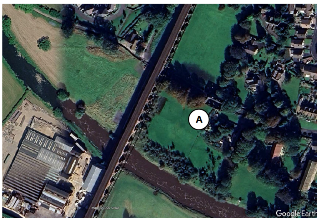
Site plan showing measurement position

The measurement position is shown on the site plan below.