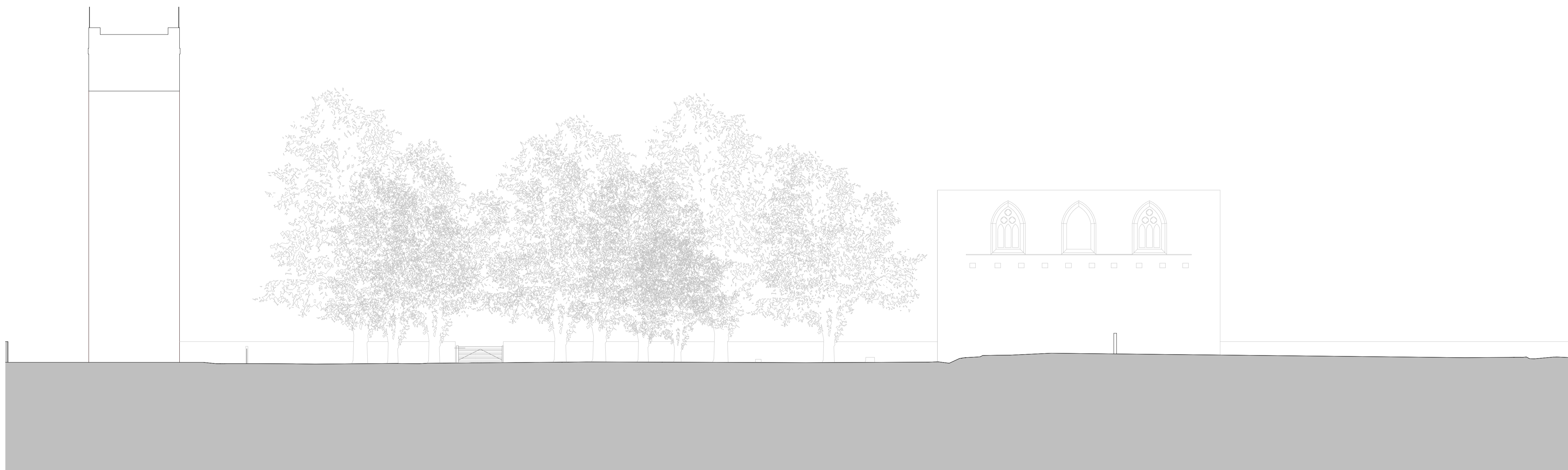
2 Existing South Elevation 1:200