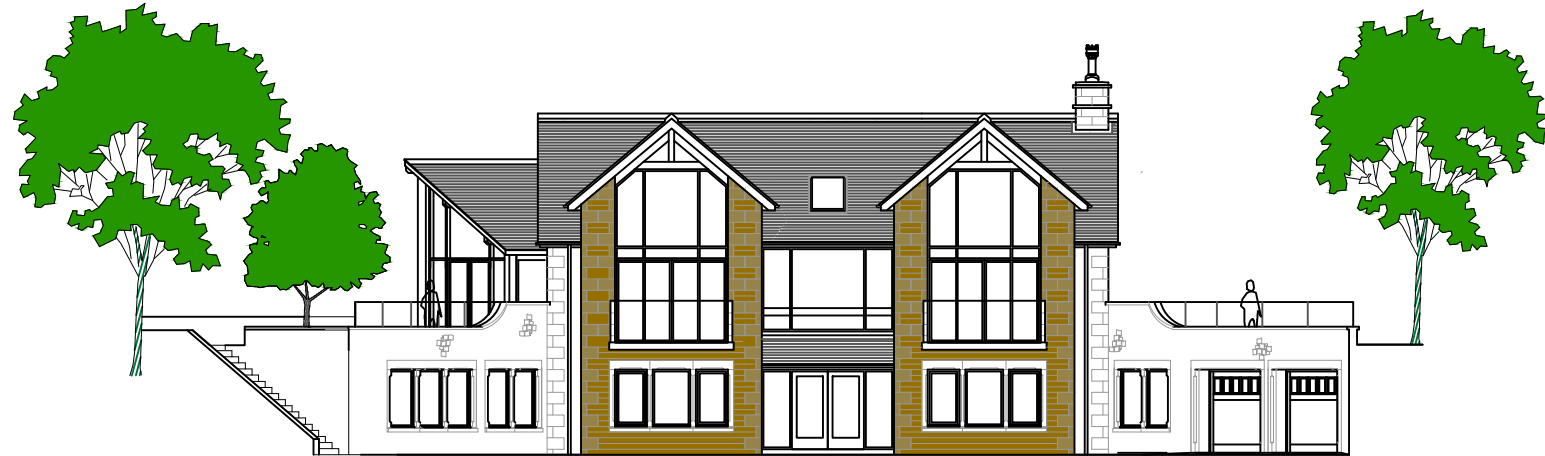
EXISTING EAST ELEVATION (1:200)