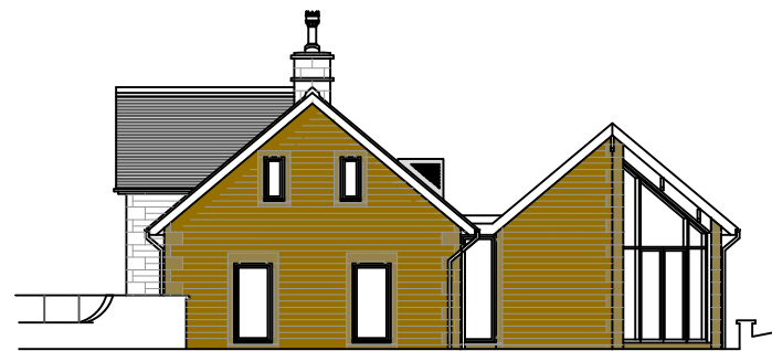
EXISTING NORTH ELEVATION (1:200)