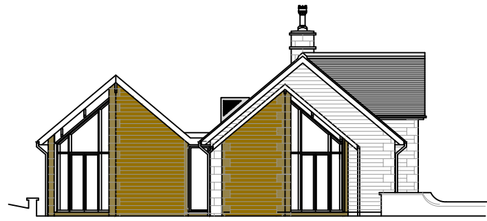
EXISTING SOUTH ELEVATION (1:200)

This drawing is to be read in conjunction with all relevant Architect, consultants' and specialists' drawings and specifications. The Architect is to be notified of any discrepancies before proceeding. Do not scale from this drawing. All dimensions and levels are to be checked on site. This drawing is subject to copyright. All work carried out before Planning and Building Permission has been granted is at the contractor/clients risk. Note: proposed drawing based on OS dwg information. All illustrated dimensions are approximate and all site dimensions are to be checked on site and subject to site survey.