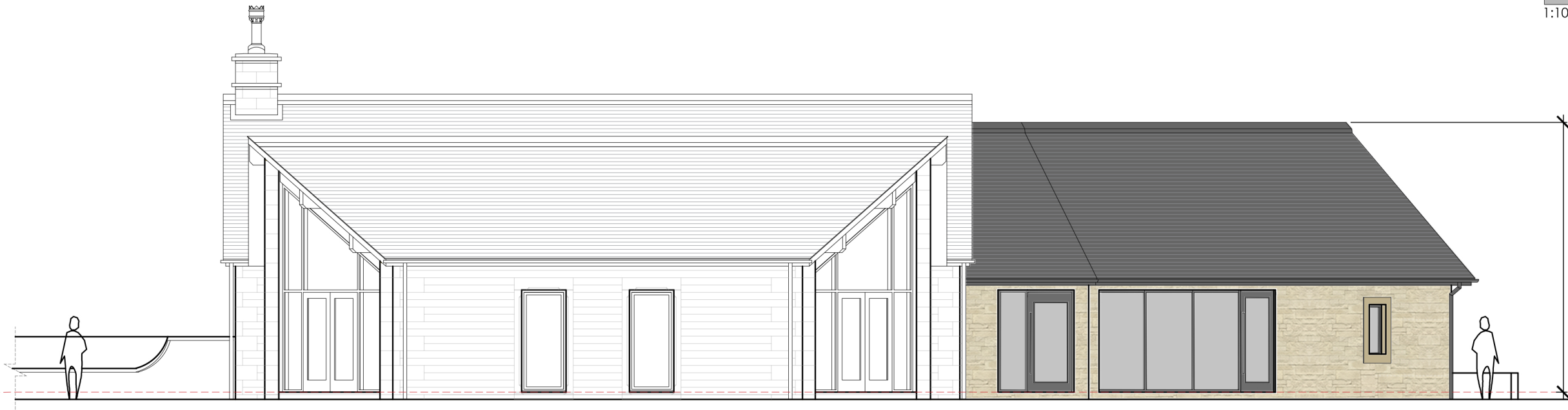
PROPOSED WEST ELEVATION SCALE 1:100