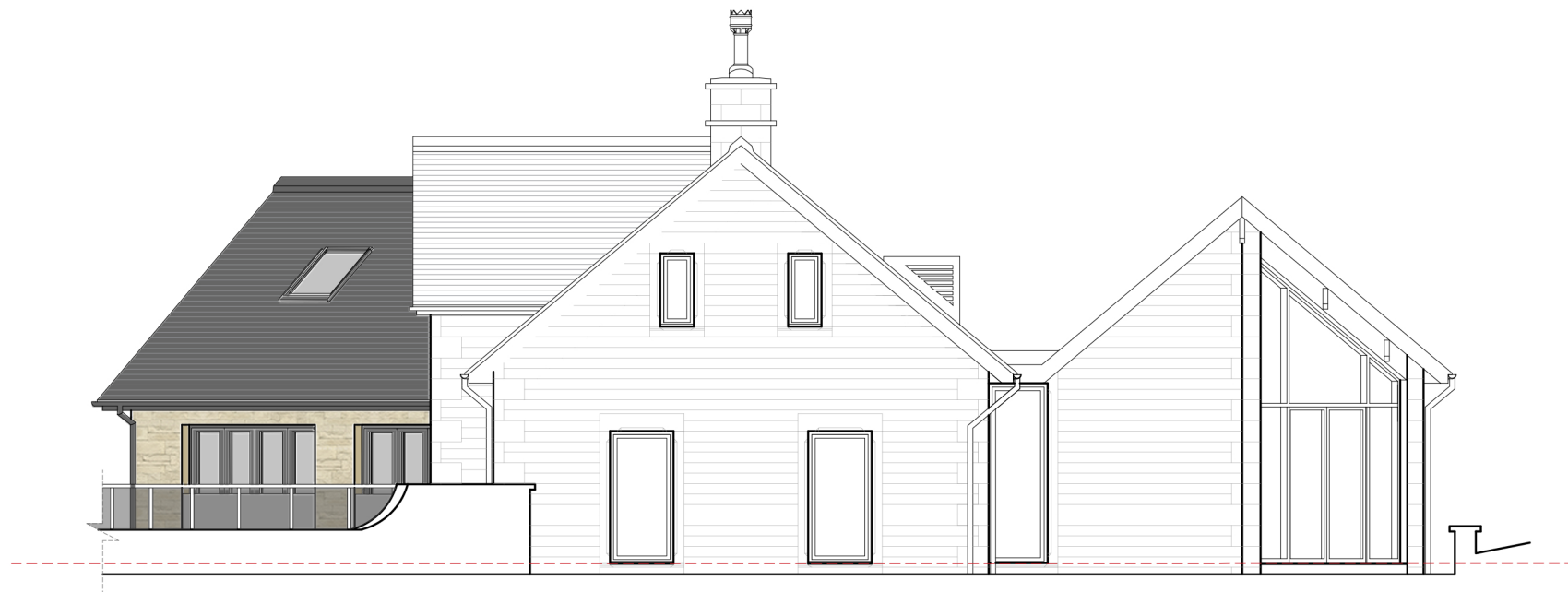
PROPOSED NORTH ELEVATION SCALE 1:100