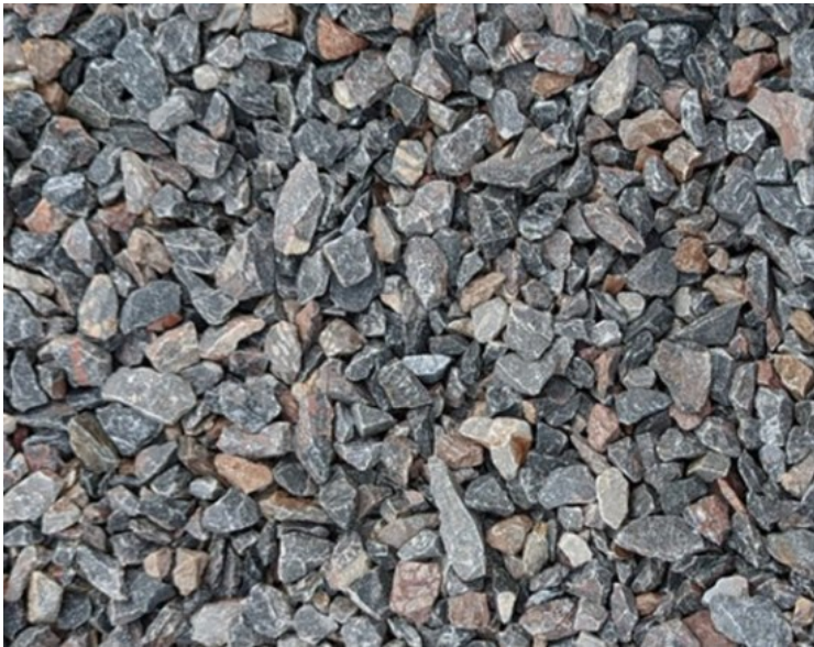
20mm to dust blue / black limestone