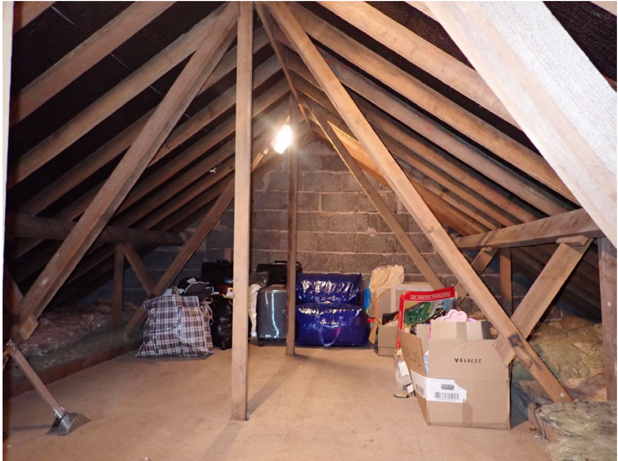
7 – The house has a single roof void.