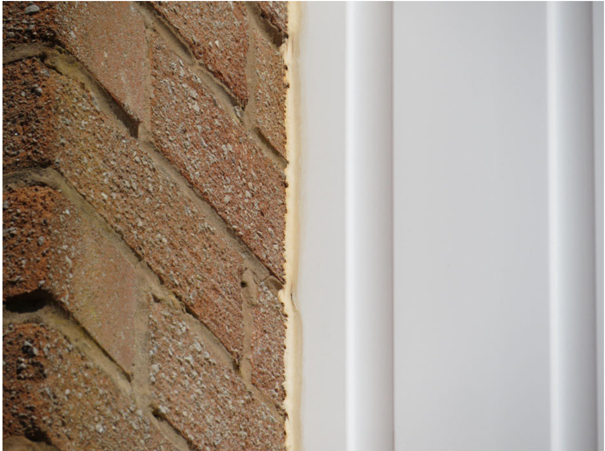
5 – UPVC cladding is fitted tightly with no suitable gaps.