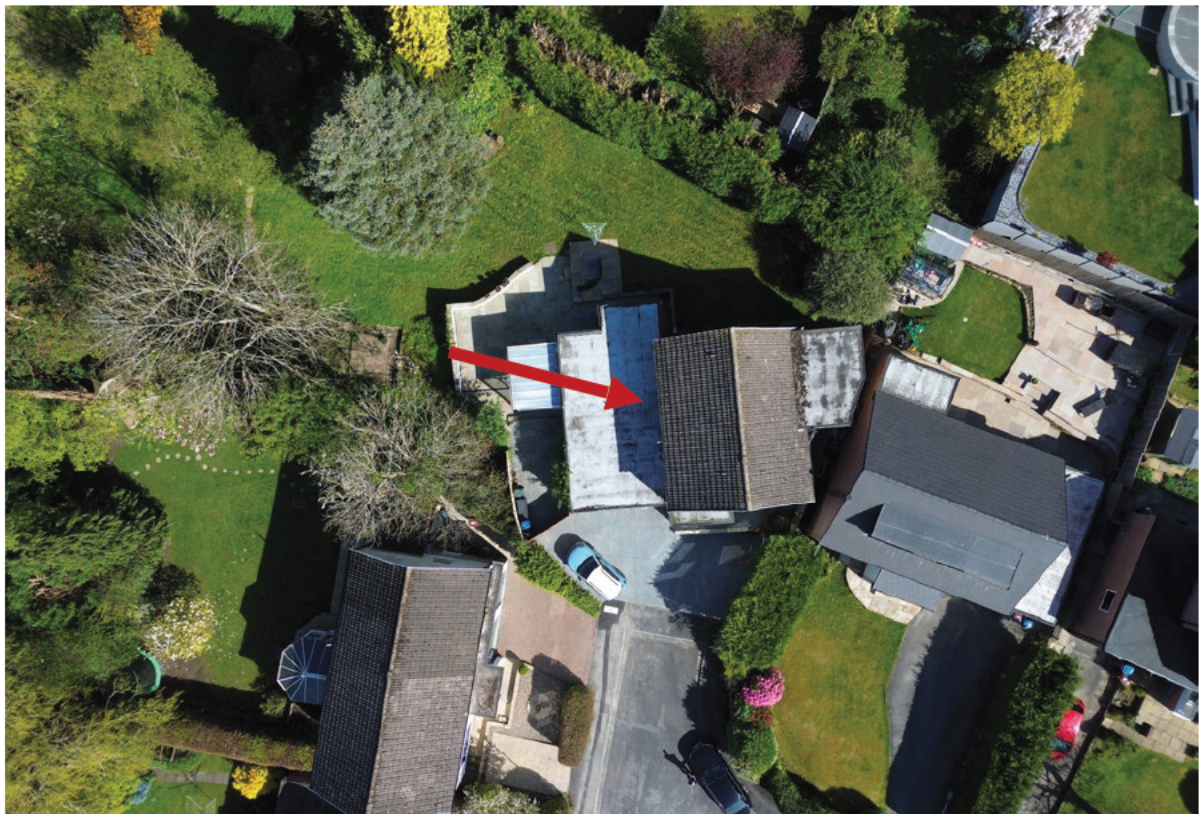
1.6b – 18 Harewood Avenue – aerial photograph.