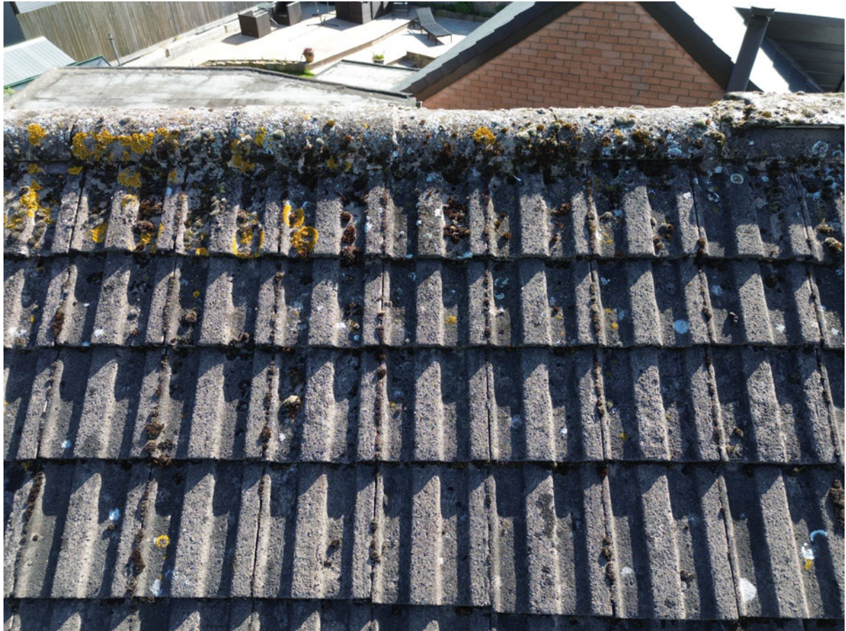
3 – Roof and ridge tiles are in good condition with no suitable gaps.