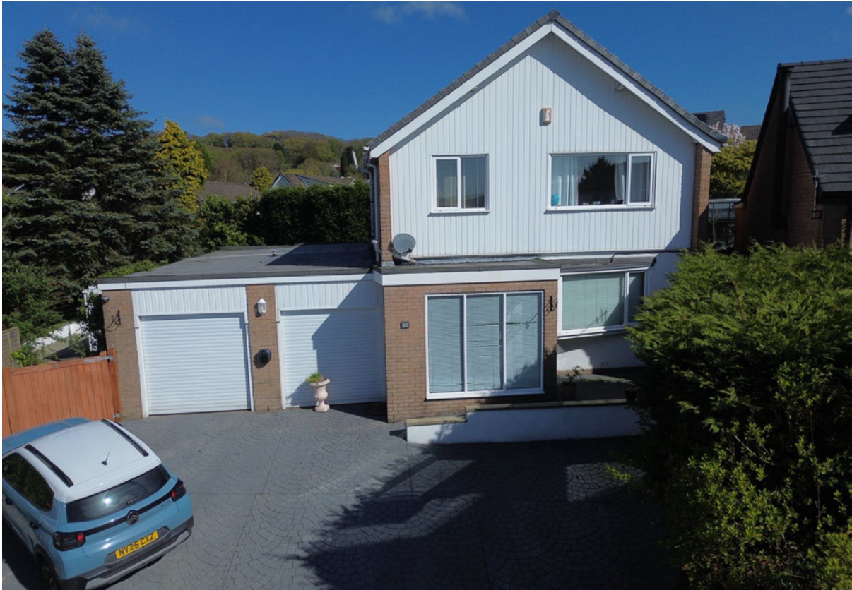
1 – The front of the house.