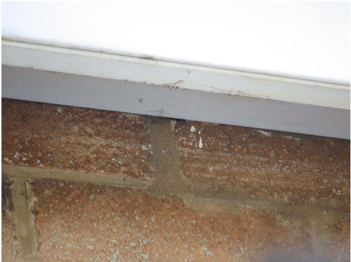
4 – Fascia boards and soffits at the eaves are fixed tightly against brickwork.