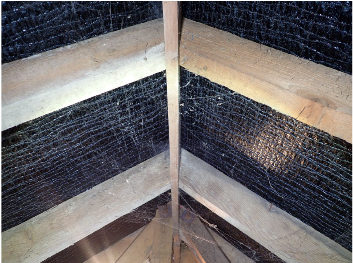
8 – Roof lining is in good condition with no gaps or tears.