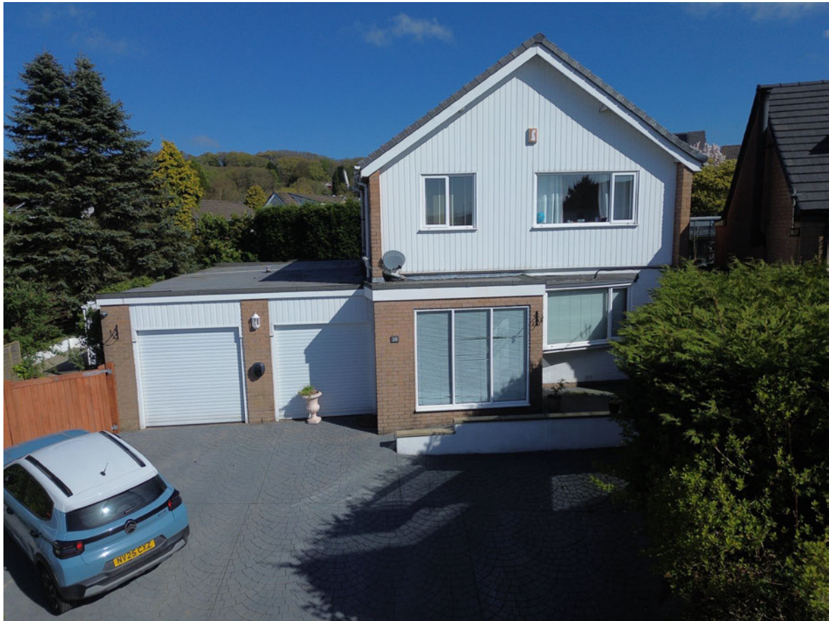
3.1a – The front of the house.

Nº18 Harewood Avenue, Simonstone, is a 1970's built detached house, which is currently occupied. It has a pitched roof, covered with concrete roof and ridge tiles. An attached double garage to the side has a flat felt-covered roof.