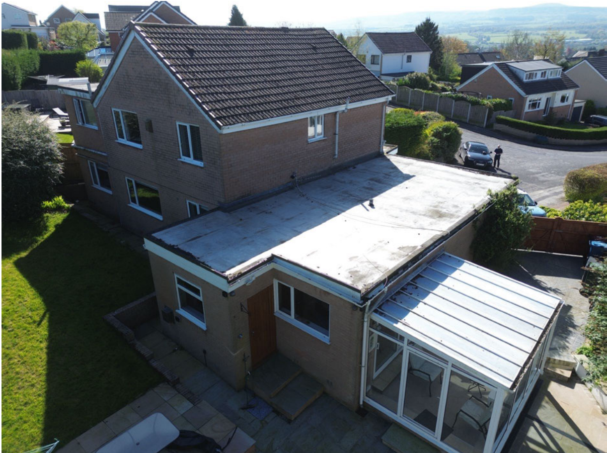
2 – The rear of the house.