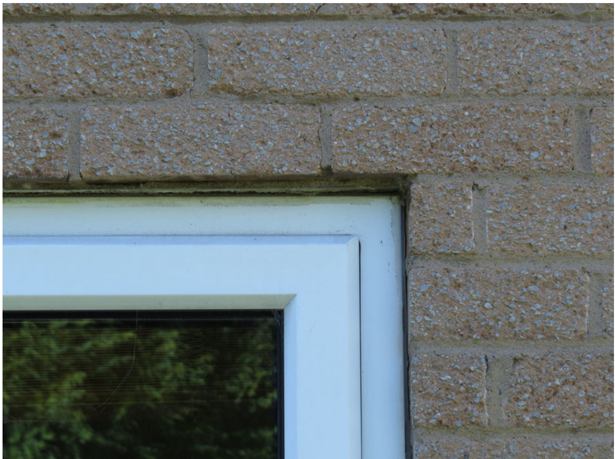
6 – Brickwork is in good condition windows are tightly fitted with no suitable gaps.