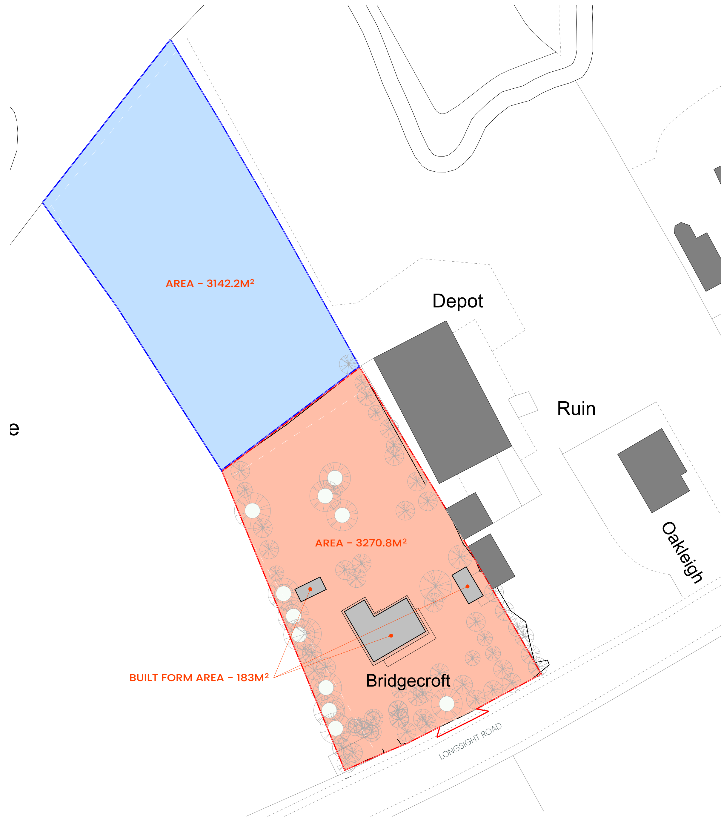
1 EXISTING AREA PLAN - PLANNING 1:500