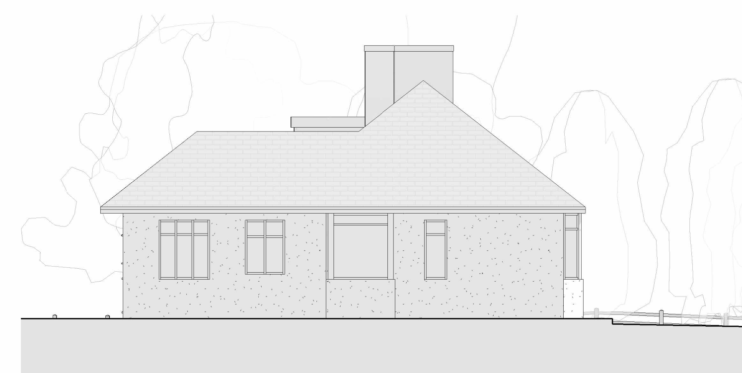
4 EXISTING HOUSE - SW ELEVATION 1: 100