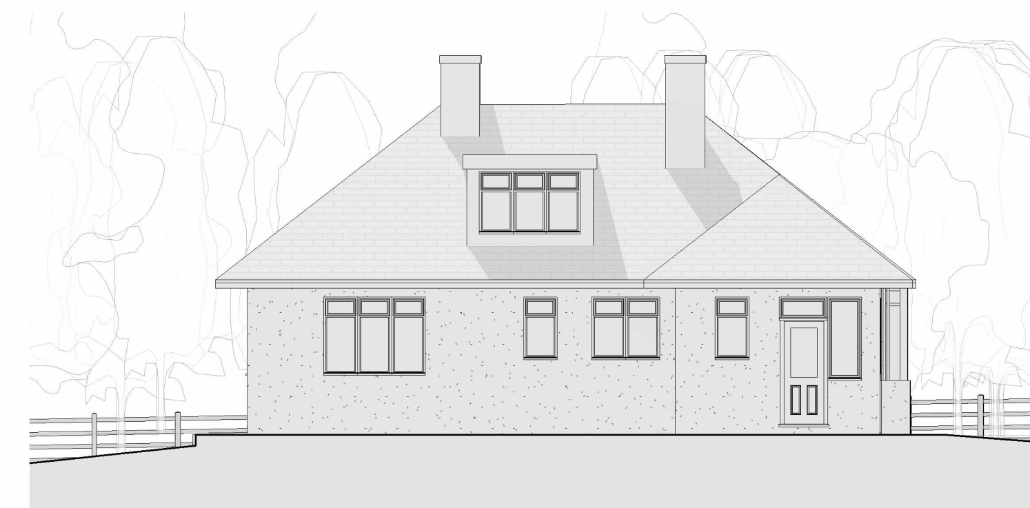
5 EXISTING HOUSE - NW ELEVATION 1: 100