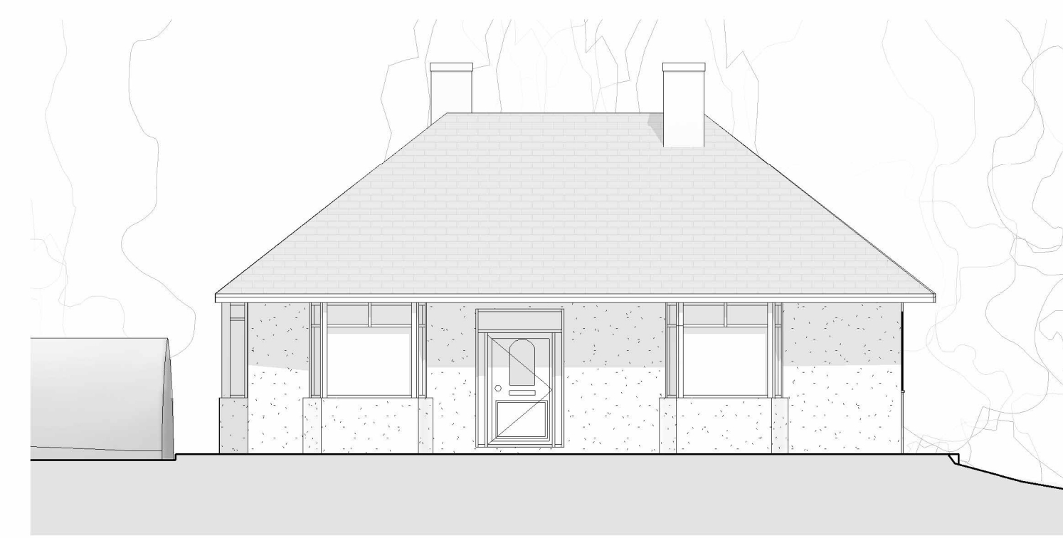
2 EXISTING HOUSE - SE ELEVATION 1: 100