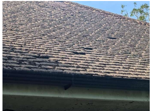
Photograph 5: B1 – PRF2: Missing roof tiles.