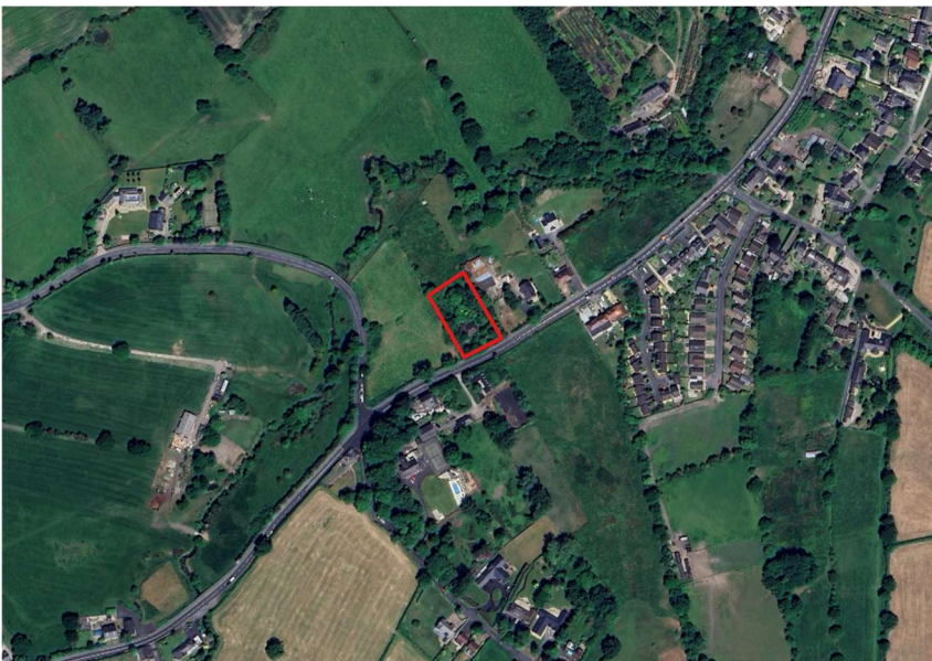
Figure 1.1: Aerial image of land at Longsight Road, with red line survey area

The site is situated within a rural area of Copster Green, north of Blackburn. The surrounding landscape comprises, agricultural land and residential dwellings. The sites central National Grid Reference is SD 6715 3363. An aerial image of the area subject to survey is shown below.