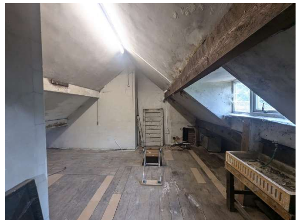
Photograph 6: B1, vaulted loft space with plastered finish.