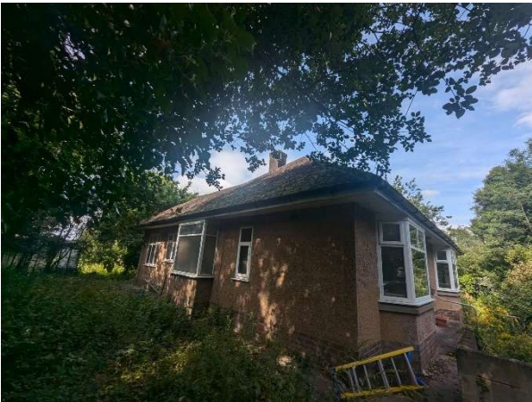
Photograph 2: Western aspect of B1.