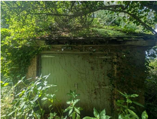
Photograph 8: Southern aspect of B2 with missing fascia and gaps leading to roof structure.