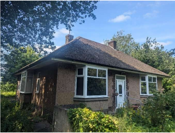
Photograph 1: Southern aspect of B1.