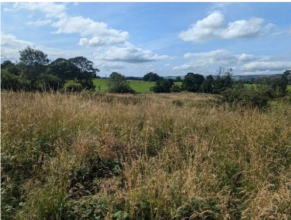
Photograph 14: Modified grassland in the north of the site.