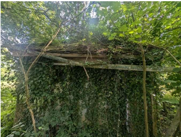
Photograph 9: Northern aspect of B2 with broken fascia and gaps under tiles.