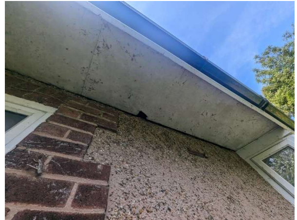
Photograph 4: B1 – PRF1: Hole in soffit box.