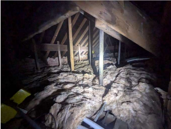
Photograph 7: B1 loft space over west side of building.