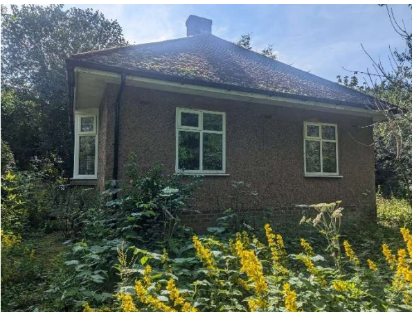
Photograph 3: Northern aspect of B1.