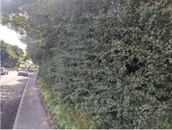
Photograph 13: Native hedgerow defining southern border of the site.