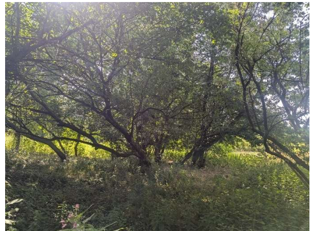
Photograph 11: Other broadleaved woodland.