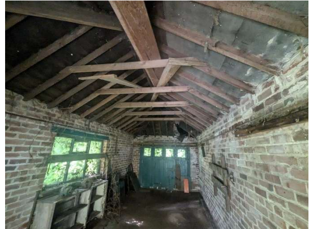
Photograph 10: Internal view of B2.