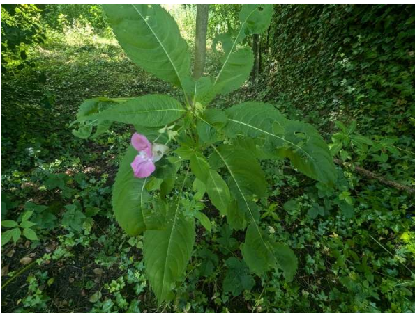
Photograph 15: Himalayan balsam.