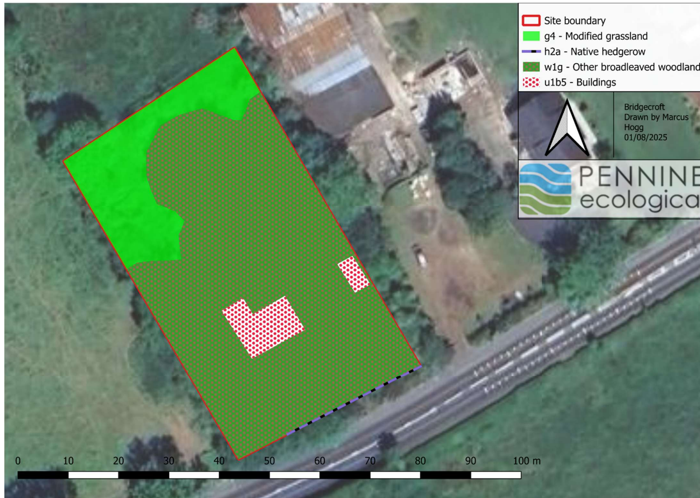
Figure 1 – UKHabs Baseline Map