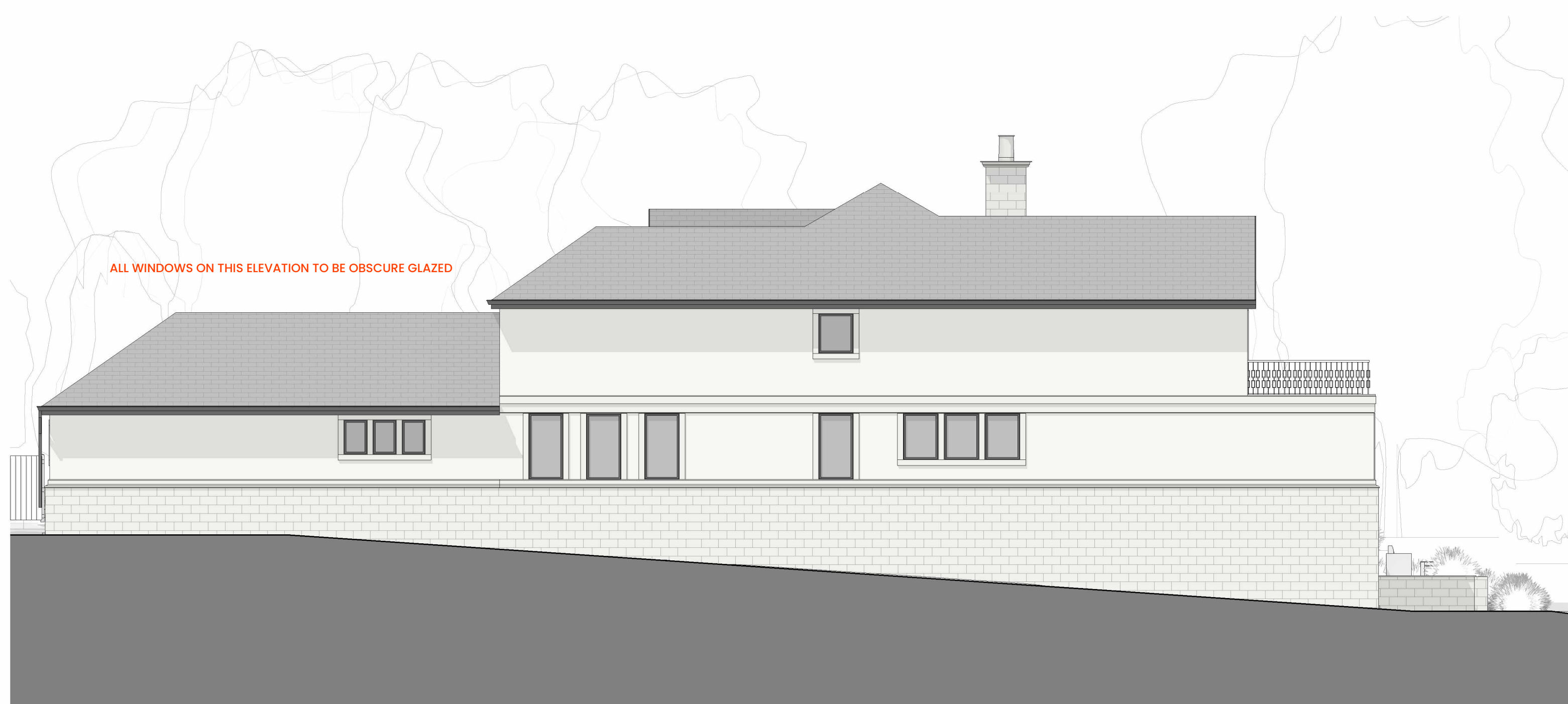
2 PROPOSED - NE ELEVATION 1:100