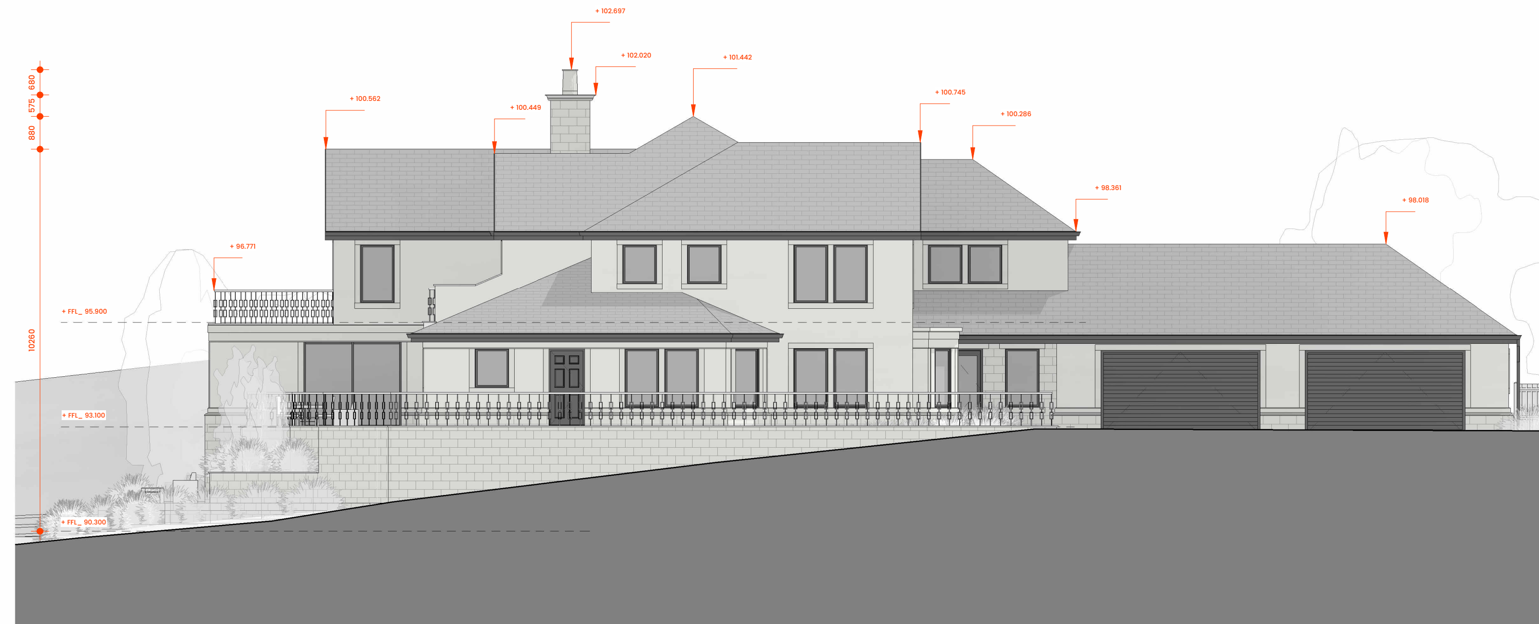
1 PROPOSED - SW ELEVATION 1:100