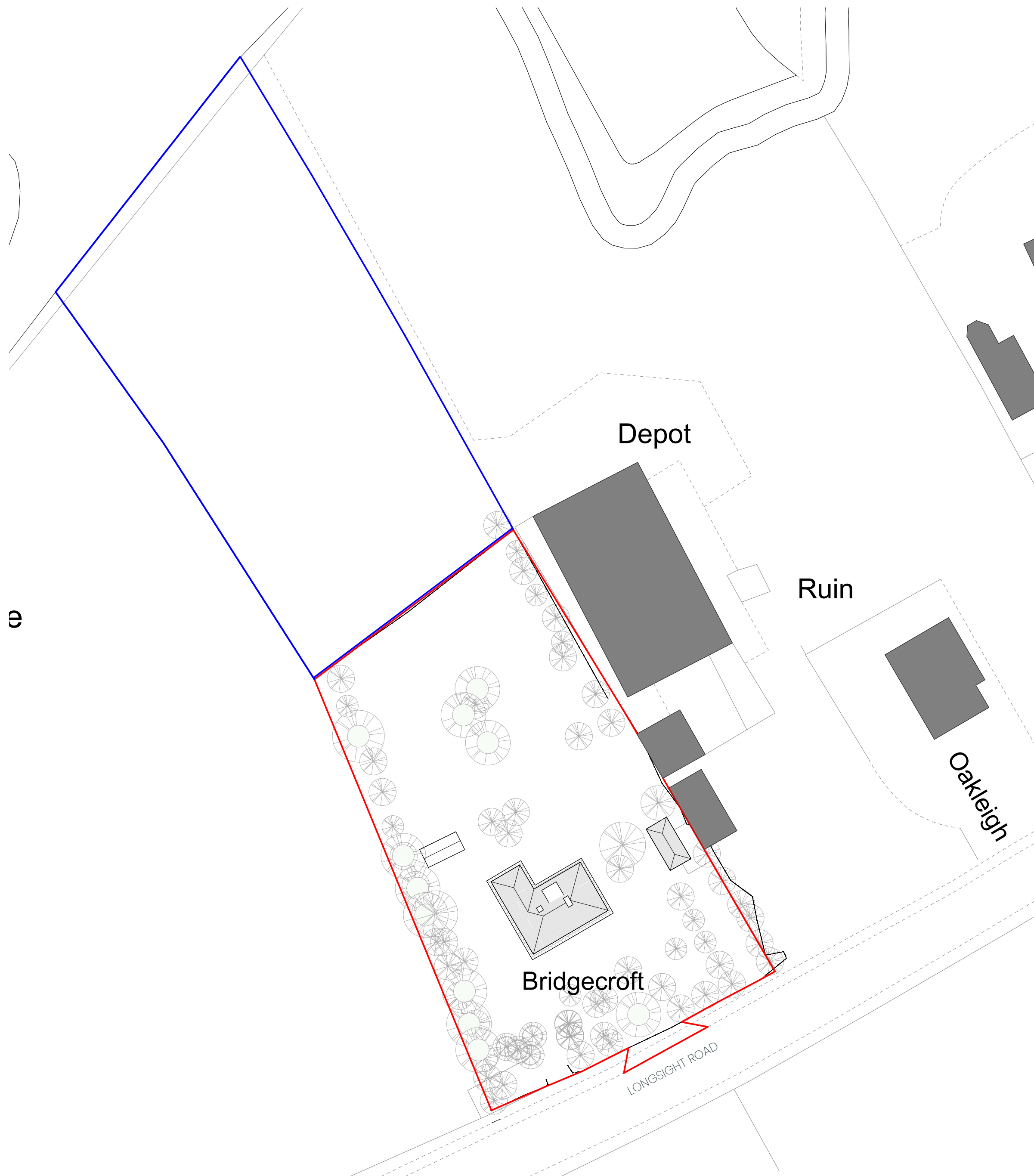
1 EXISTING SITE PLAN - PLANNING 1: 500